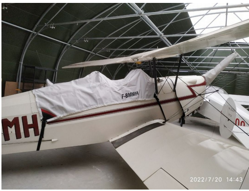
Stampe SV-4 Canopy Cover