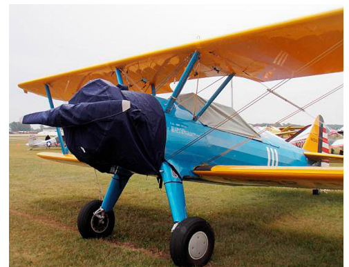
Stearman PT-13 Engine Cover