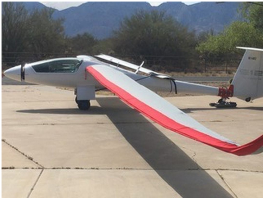
Stemme S-12 Wing Covers, Spandex Type

WINTER USE MATERIAL - Made with Solution-Dyed Polyester fabric, this option is intended for seasonal use to aid in deicing, rain mitigation, or for occasional travel. The material is lighter and more compact, but more susceptible to UV damage and may have a shorter useful life if used continuously outside than the all-year use material.