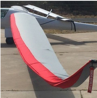
Stemme S-12 Wing Covers, Spandex Type