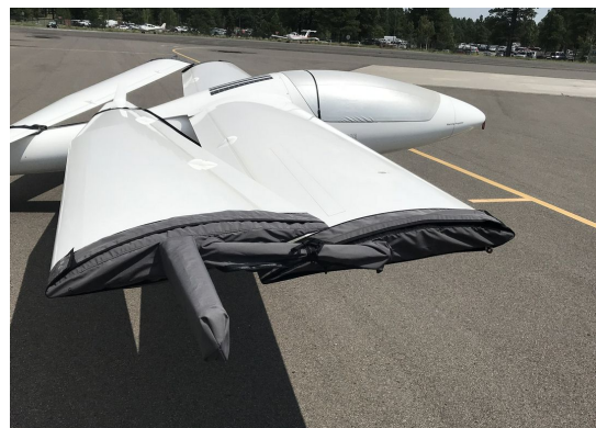
STEMME S10-VT WING FOLD COVERS