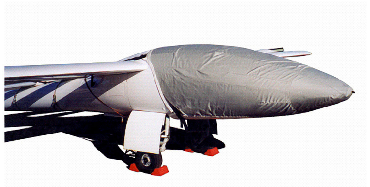
Stemme Cockpit/Nose Cover