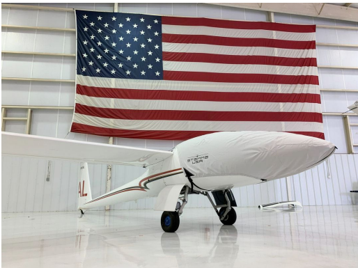
Stemme S-12 Canopy/Nose Cover