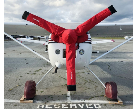
Cessna Skywagon Propellor/Spinner Cover, 3-blade type