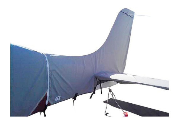
Cirrus SR-22 Complete Cover Set