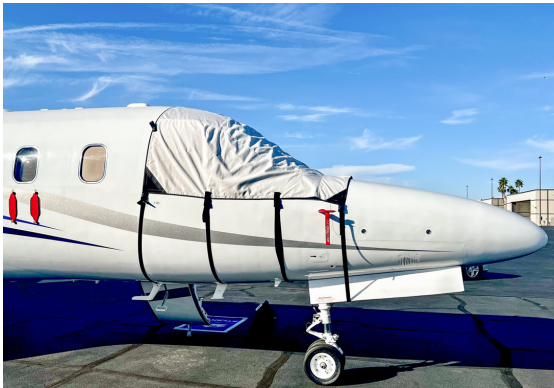
IAI Astra SPX Cockpit Cover

This cover type is made from Silver Acrylic Sunbrella canvas and is 100% lined with a soft and smooth microfiber. Bruce's Custom Covers developed this material combination especially for aircraft protection. The outer material is medium weight and treated for water resistance, UV resistance and anti-static buildup. The inner lining is a very soft and smooth microfiber to prevent scratching. The material is very reflective, and tests show that the cabin interior temperature can be reduced to near-ambient temperature on the hottest of days. It is water, ice and snow repellent, yet breathable to allow moisture to escape from between the cover and the aircraft surface.