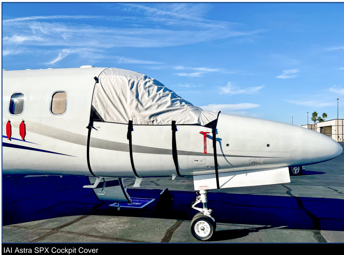
IAI Astra SPX Cockpit Cover