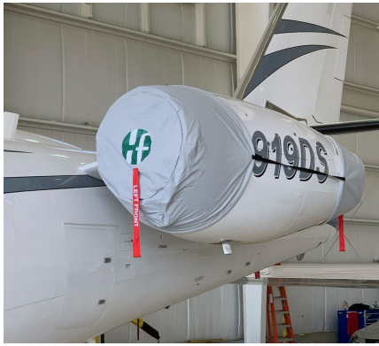
Astra SPX Engine Covers with TR's