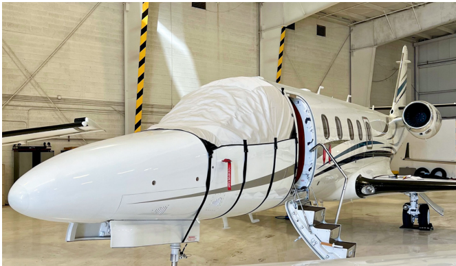
Astra SPX Cockpit Cover