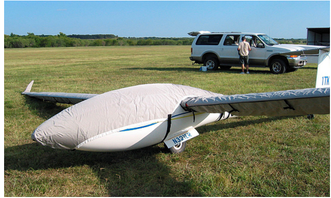
Canopy/Nose Cover, Wings and Horizontal Stab Covers