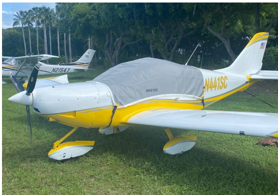
SportCruiser Travel Canopy Cover

Travel Covers are made with Silver Solution-Dyed Polyester fabric and only lined over the windshield to save weight. The material is lightweight and more compact for easy stowage in the aircraft. The polyester material is water resistant, but only intended for occasional use outside. We also have an ultra lightweight material available for fitted hangar dust covers. For daily outdoor use, the non-travel Sunbrella Cover is the best choice.