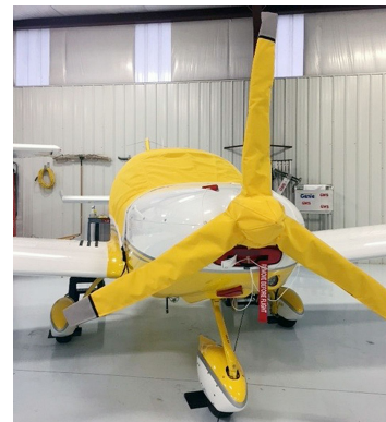
Custom Yellow Canopy Cover, Prop/Spinner, and Inlet Plugs