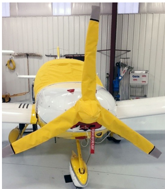
Custom Yellow Canopy Cover, Prop/Spinner, and Inlet Plugs

This cover type is made from Silver Acrylic Sunbrella canvas and is 100% lined with a soft and smooth microfiber. Bruce's Custom Covers developed this material combination especially for aircraft protection. The outer material is medium weight and treated for water resistance, UV resistance and anti-static buildup. The inner lining is a very soft and smooth microfiber to prevent scratching. The material is very reflective, and tests show that the cabin interior temperature can be reduced to near-ambient temperature on the hottest of days. It is water, ice and snow repellent, yet breathable to allow moisture to escape from between the cover and the aircraft surface.