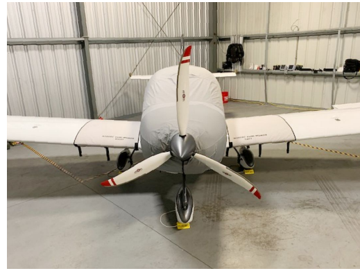
SportCruiser Canopy/Engine & Wing Covers