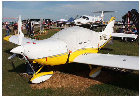
PiperSport Canopy Cover, Engine Plugs