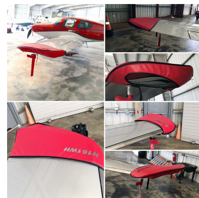
Cirrus SR22 Wingtip Pads, G5 Models