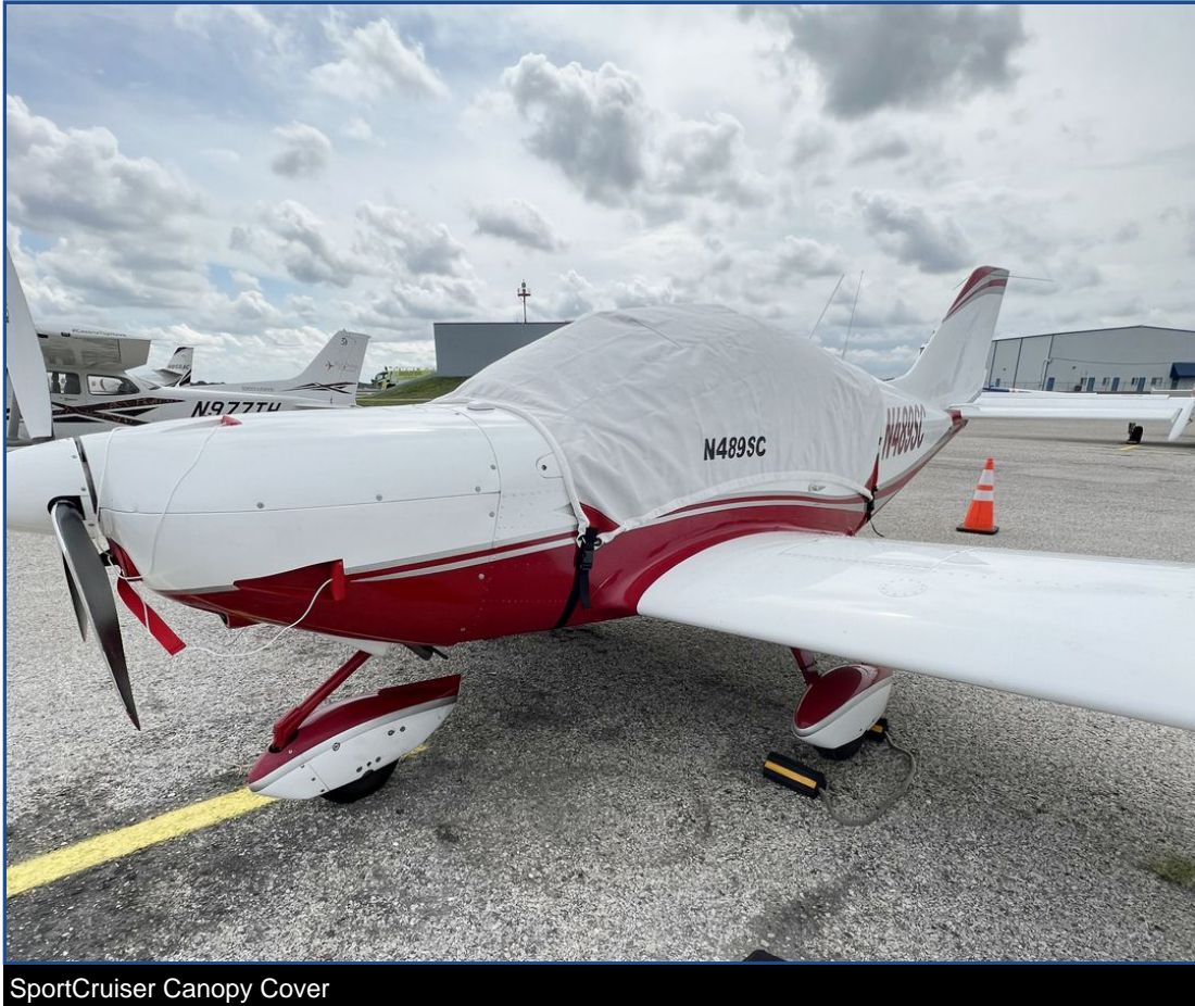
SportCruiser Canopy Cover