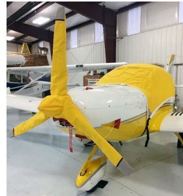
Custom Yellow Canopy Cover, Prop/Spinner, and Inlet Plugs