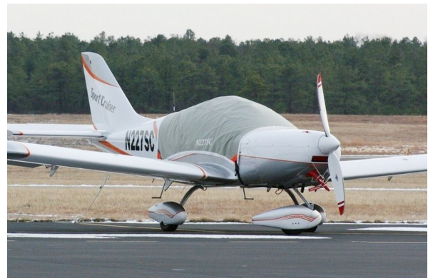
SPORTCRUISER CANOPY COVER