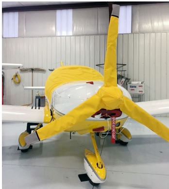
Custom Yellow Canopy Cover, Prop/Spinner, and Inlet Plugs

Engine Inlet Plugs are custom fit for your Czech Aircraft Works SportCruiser intakes, made with heavy-duty vinyl material, and stuffed with a single block of sculpted urethane foam. Each plug has a zipper that allows the foam to be removed and dried if necessary. Engine plugs have warning flags that are visible from the cockpit or 'remove before flight' streamers sewn onto the face of the plugs. Most plugs are imprinted with the aircraft registration number in black for an extra charge. Storage bag NOT included. Engine plugs may be inserted after flight when the engine is still warm. Engine Inlet Plugs are commonly referred to as Cowl Plugs, Intake Plugs, Cowl Blocks, Engine Blocks, and Engine Bungs.