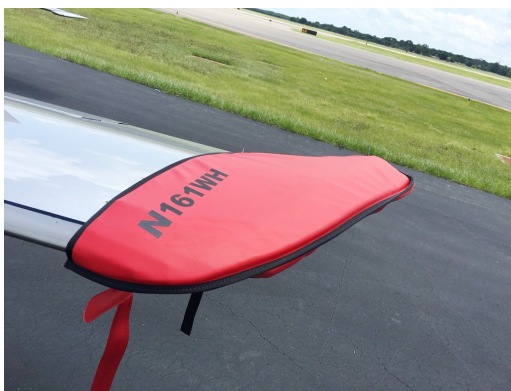
Cirrus SR-20/22 Wingtip Pads

Designed to prevent damage to the aircraft extremities in crowded hangars, these products are made of bright red Naugahyde and thickly padded with a sandwich of closed cell foam.