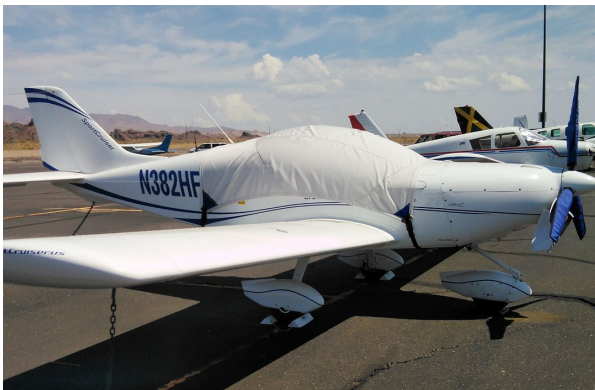
Czech Aircraft Works Sport Cruiser

This cover type is made from Silver Acrylic Sunbrella canvas and is 100% lined with a soft and smooth microfiber. Bruce's Custom Covers developed this material combination especially for aircraft protection. The outer material is medium weight and treated for water resistance, UV resistance and anti-static buildup. The inner lining is a very soft and smooth microfiber to prevent scratching. The material is very reflective, and tests show that the cabin interior temperature can be reduced to near-ambient temperature on the hottest of days. It is water, ice and snow repellent, yet breathable to allow moisture to escape from between the cover and the aircraft surface.