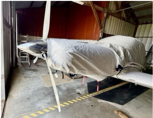
Micco SP20 Engine Cover

shorter useful life if used continuously outside than the all-year use material.