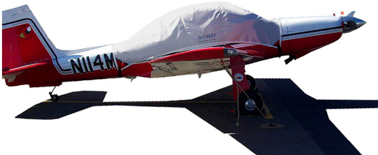
Micco SP20 Canopy Cover & Engine Inlet Plugs