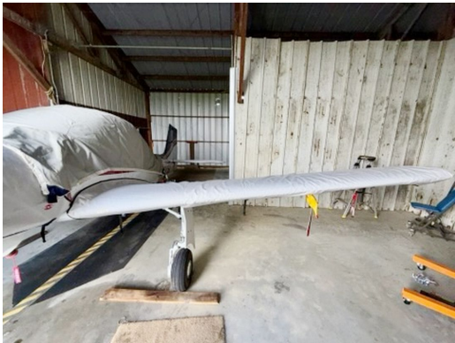
Micco SP20 Wing Covers, All Year Use

This cover type is made from Silver Acrylic Sunbrella canvas and is 100% lined with a soft and smooth microfiber. Bruce's Custom Covers developed this material combination especially for aircraft protection. The outer material is medium weight and treated for water resistance, UV resistance and anti-static buildup. The inner lining is a very soft and smooth microfiber to prevent scratching. The material is very reflective, and tests show that the cabin interior temperature can be reduced to near-ambient temperature on the hottest of days. It is water, ice and snow repellent, yet breathable to allow moisture to escape from between the cover and the aircraft surface.