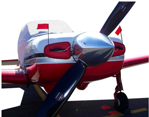
Micco SP20 Canopy Cover & Engine Inlet Plugs

The Micco SP20 Canopy/Engine Cover is a one-piece cover (100% lined with microfiber) that is a combination of the Canopy Cover and Engine Cover. This cover will enclose the engine cowl and will extend aft to cover all of the windows. This cover type is made from Silver Acrylic Sunbrella canvas and is 100% lined with a soft and smooth microfiber. Bruce's Custom Covers developed this material combination especially for aircraft protection. The outer material is medium weight and treated for water resistance, UV resistance and anti-static buildup. The inner lining is a very soft and smooth microfiber to prevent scratching. The material is very reflective, and tests show that the cabin interior temperature can be reduced to near-ambient temperature on the hottest of days. It is water, ice and snow repellent, yet breathable to allow moisture to escape from between the cover and the aircraft surface.