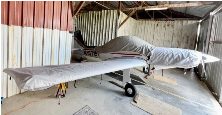
Micco SP20 Canopy Wing & Engine Covers