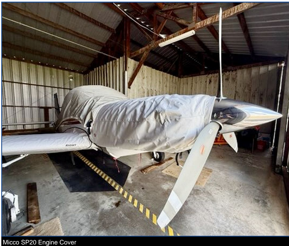
Micco SP20 Engine Cover