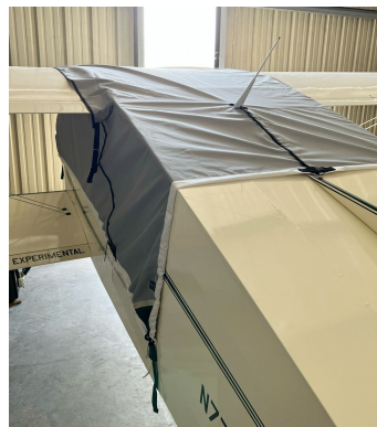
Sorrell SNS-7 Hiperbipe Over The Top Travel Canopy Cover