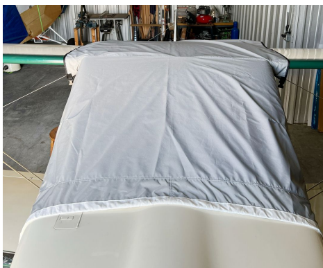
Sorrell SNS-7 Hiperbipe Over The Top Travel Canopy Cover

Travel Covers are made with Silver Solution-Dyed Polyester fabric and only lined over the windshield to save weight. The material is lightweight and more compact for easy stowage in the aircraft. The polyester material is water resistant, but only intended for occasional use outside. We also have an ultra lightweight material available for fitted hangar dust covers. For daily outdoor use, the non-travel Sunbrella Cover is the best choice.