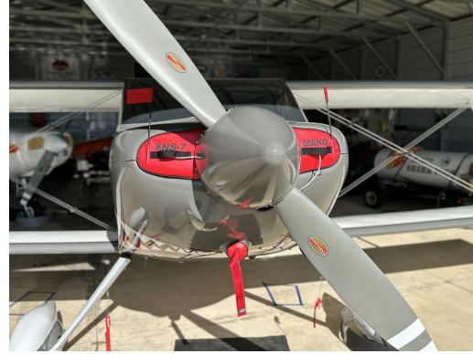
SNS-7 HiperBipe Engine Inlet Plugs