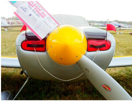
Vans's RV-7 Engine Engine Inlet Plugs

Engine Inlet Plugs are custom fit for your Sorrell Hiperbipe SNS-7 intakes, made with heavy-duty vinyl material, and stuffed with a single block of sculpted urethane foam. Each plug has a zipper that allows the foam to be removed and dried if necessary. Engine plugs have warning flags that are visible from the cockpit or 'remove before flight' streamers sewn onto the face of the plugs. Most plugs are imprinted with the aircraft registration number in black for an extra charge. Storage bag NOT included. Engine plugs may be inserted after flight when the engine is still warm. Engine Inlet Plugs are commonly referred to as Cowl Plugs, Intake Plugs, Cowl Blocks, Engine Blocks, and Engine Bungs.