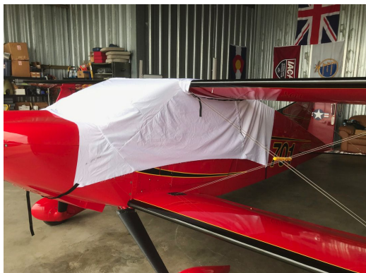
Sorrell Hiperbipe Canopy Cover (test fit cover)

Travel Covers are made with Silver Solution-Dyed Polyester fabric and only lined over the windshield to save weight. The material is lightweight and more compact for easy stowage in the aircraft. The polyester material is water resistant, but only intended for occasional use outside. We also have an ultra lightweight material available for fitted hangar dust covers. For daily outdoor use, the non-travel Sunbrella Cover is the best choice.