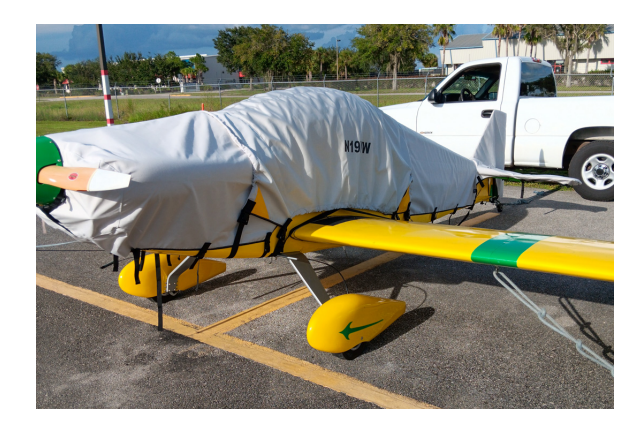
Lancair 320 Complete Fuselage/Wing Cover & Prop Cover