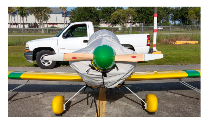
Sonerai Racer Engine Cover

The material is very reflective, and tests show that the cabin interior temperature can be reduced to near-ambient temperature on the hottest of days. It is water, ice and snow repellent, yet breathable to allow moisture to escape from between the cover and the aircraft surface.