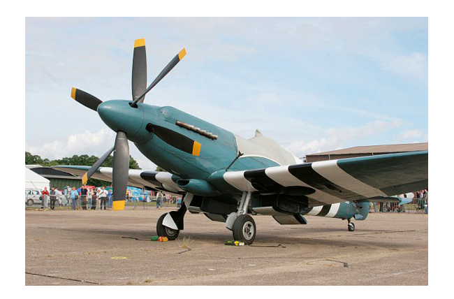
Supermarine Spitfire XIX Canopy Cover