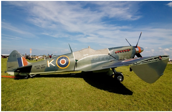
Supermarine Spitfire Mk IX Canopy Cover