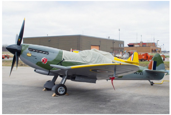
Supermarine Spitfire Mk 14 Canopy Cover