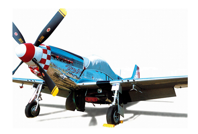
Canopy Cover, Belly & Chin Scoop Plugs