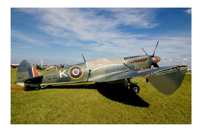
Supermarine Spitfire Mk IX Canopy Cover

Travel Covers are made with Silver Solution-Dyed Polyester fabric and only lined over the windshield to save weight. The material is lightweight and more compact for easy stowage in the aircraft. The polyester material is water resistant, but only intended for occasional use outside. We also have an ultra lightweight material available for fitted hangar dust covers. For daily outdoor use, the non-travel Sunbrella Cover is the best choice.