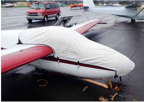
SGS 1-26B Canopy/Nose Cover