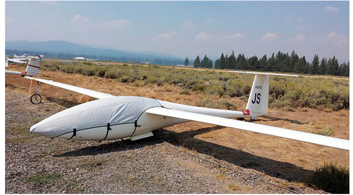
ASW-20C Canopy/Nose Cover