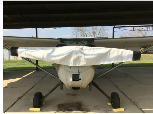
Stinson L-5 Sentinel Propellor/Spinner Cover