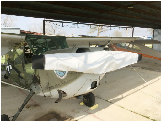
Stinson L-5 Sentinel Propellor/Spinner Cover

the hottest of days. It is water, ice and snow repellent, yet breathable to allow moisture to escape from between the cover and the aircraft surface.