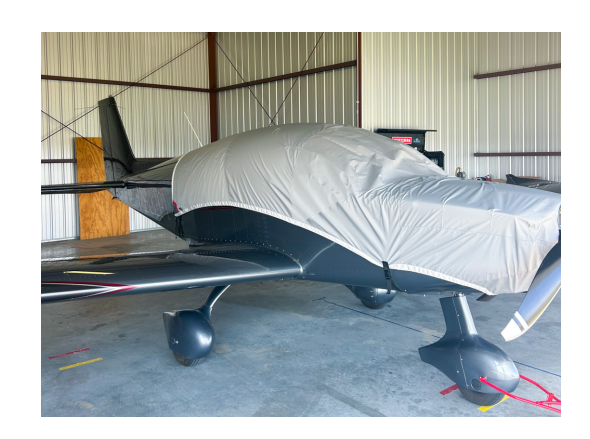
Sling TSI Travel Cover, Light Weight Canopy/Engine Cover