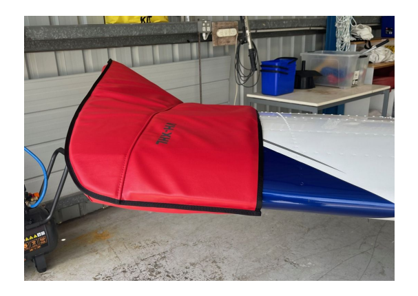
Sling TSI Wingtip Pads