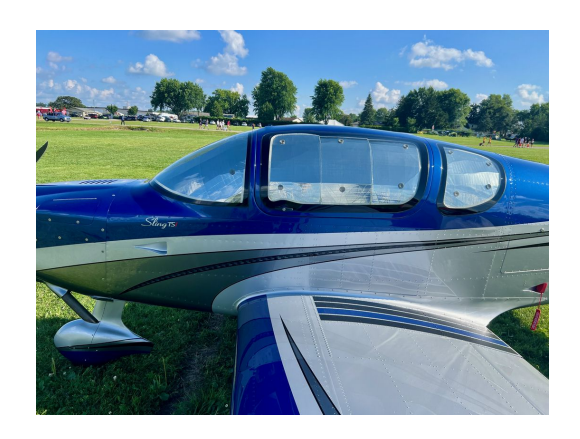
Airplane Factory Sling TSi HeatShield Set