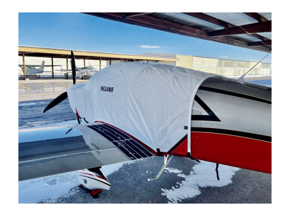
Airplane Factory Sling TSI Extended Canopy/Engine Cover

This cover type is made from Silver Acrylic Sunbrella canvas and is 100% lined with a soft and smooth microfiber. Bruce's Custom Covers developed this material combination especially for aircraft protection. The outer material is medium weight and treated for water resistance, UV resistance and anti-static buildup. The inner lining is a very soft and smooth microfiber to prevent scratching. The material is very reflective, and tests show that the cabin interior temperature can be reduced to near-ambient temperature on the hottest of days. It is water, ice and snow repellent, yet breathable to allow moisture to escape from between the cover and the aircraft surface.