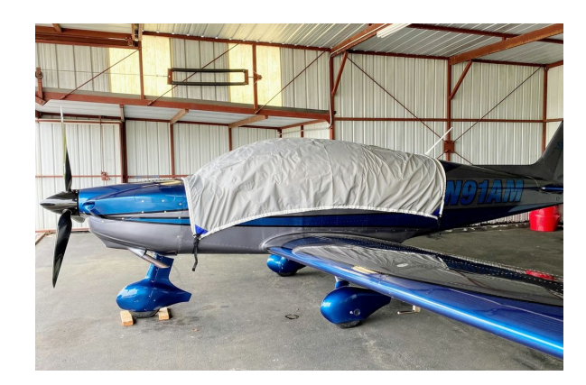
Sling 4 TSI Light Weight Travel Cover

Travel Covers are made with Silver Solution-Dyed Polyester fabric and only lined over the windshield to save weight. The material is lightweight and more compact for easy stowage in the aircraft. The polyester material is water resistant, but only intended for occasional use outside. We also have an ultra lightweight material available for fitted hangar dust covers. For daily outdoor use, the non-travel Sunbrella Cover is the best choice.