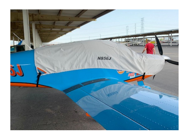
Airplane Factory Sling 4 Canopy/Engine Cover