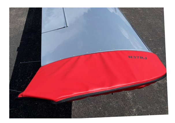
Cirrus SR-22 Wingtip Pads

Designed to prevent damage to the aircraft extremities in crowded hangars, these products are made of bright red Naugahyde and thickly padded with a sandwich of closed cell foam.