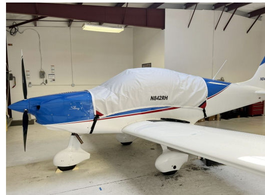
Airplane Factory Sling 2 Canopy Cover