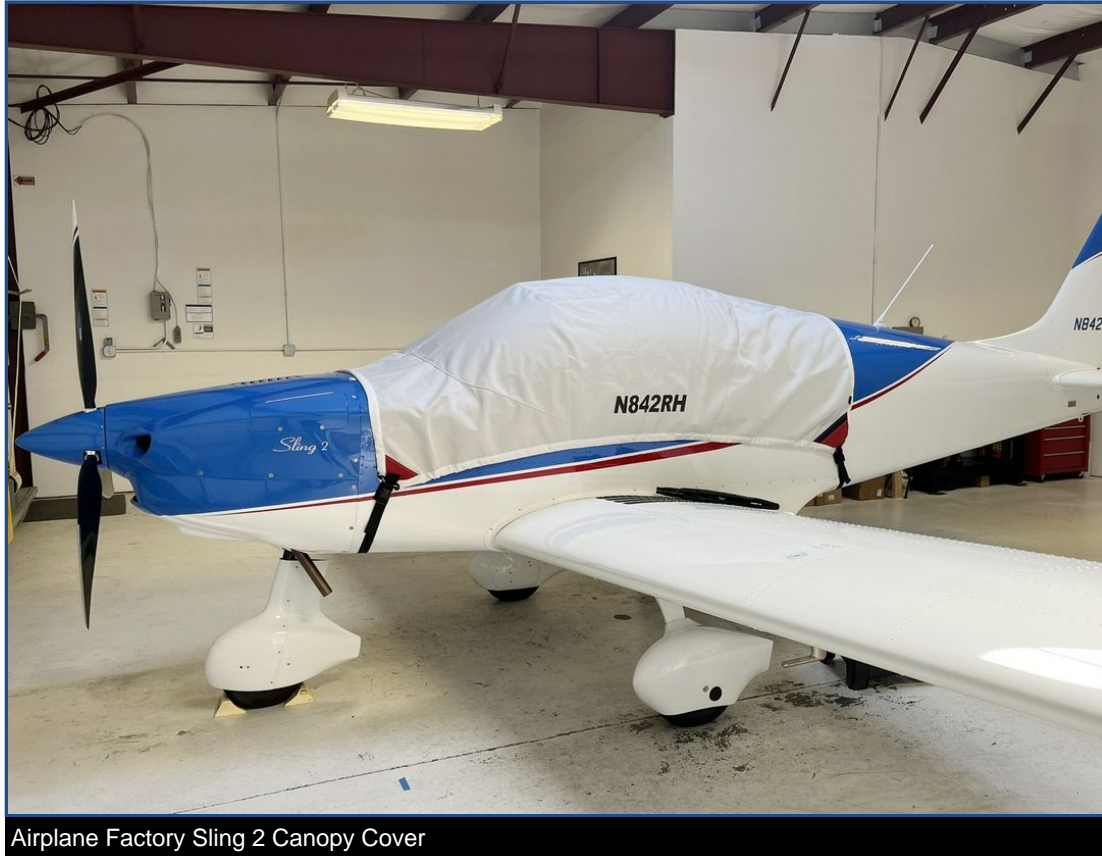
Airplane Factory Sling 2 Canopy Cover