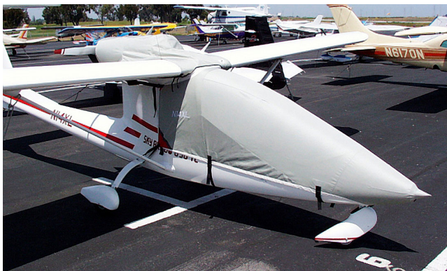
Sky Arrow Canopy & Engine Covers

This cover type is made from Silver Acrylic Sunbrella canvas and is 100% lined with a soft and smooth microfiber. Bruce's Custom Covers developed this material combination especially for aircraft protection. The outer material is medium weight and treated for water resistance, UV resistance and anti-static buildup. The inner lining is a very soft and smooth microfiber to prevent scratching. The material is very reflective, and tests show that the cabin interior temperature can be reduced to near-ambient temperature on the hottest of days. It is water, ice and snow repellent, yet breathable to allow moisture to escape from between the cover and the aircraft surface.