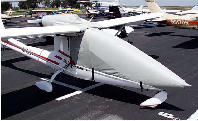
Sky Arrow Canopy & Engine Covers

This cover type is made from Silver Acrylic Sunbrella canvas and is 100% lined with a soft and smooth microfiber. Bruce's Custom Covers developed this material combination especially for aircraft protection. The outer material is medium weight and treated for water resistance, UV resistance and anti-static buildup. The inner lining is a very soft and smooth microfiber to prevent scratching. The material is very reflective, and tests show that the cabin interior temperature can be reduced to near-ambient temperature on the hottest of days. It is water, ice and snow repellent, yet breathable to allow moisture to escape from between the cover and the aircraft surface.