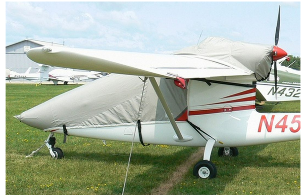
Sky Arrow Canopy/Nose & Engine Covers