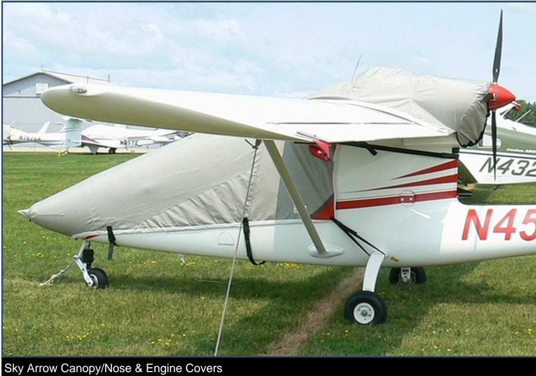
Sky Arrow Canopy/Nose & Engine Covers

(iniziative-industriali-magnaghi-aeronautica-spa-SKA.pdf)