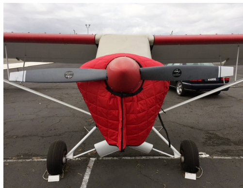
FOR INTERIOR USE. Cub Crafters CC-11 Insulated Hangar Blanket, available in Red or Silver