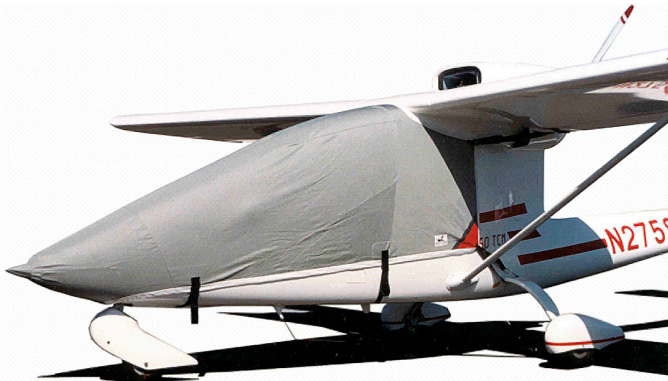
Sky Arrow Standard Canopy Cover

This cover type is made from Silver Acrylic Sunbrella canvas and is 100% lined with a soft and smooth microfiber. Bruce's Custom Covers developed this material combination especially for aircraft protection. The outer material is medium weight and treated for water resistance, UV resistance and anti-static buildup. The inner lining is a very soft and smooth microfiber to prevent scratching. The material is very reflective, and tests show that the cabin interior temperature can be reduced to near-ambient temperature on the hottest of days. It is water, ice and snow repellent, yet breathable to allow moisture to escape from between the cover and the aircraft surface.