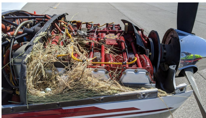
ENGINE PLUGS PREVENT BIRD NEST FOD. Piper Saratoga Engine Cowling Bird's Nest