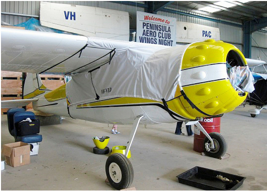
Cessna 195 Canopy Cover, over-top, 24" fwd ext to cover cowl ring gap, gas cap ext.

The material is very reflective, and tests show that the cabin interior temperature can be reduced to near-ambient temperature on the hottest of days. It is water, ice and snow repellent, yet breathable to allow moisture to escape from between the cover and the aircraft surface.