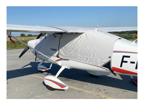
Tecnam P2010 Over-Top Canopy Cover