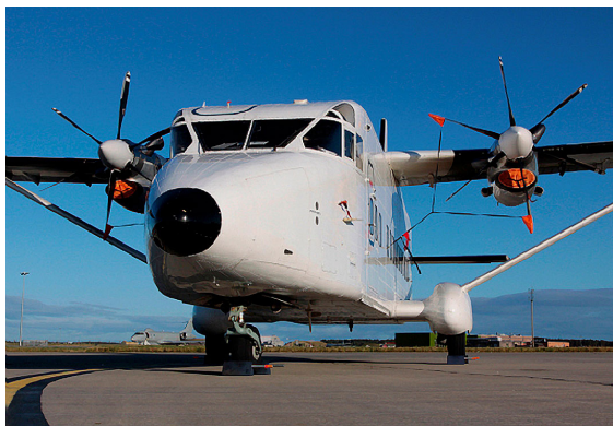
Covers, Plugs & HeatShields for the Short 330/360