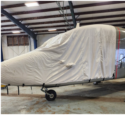
Short Skyvan Forward Fuselage/Nose Cover