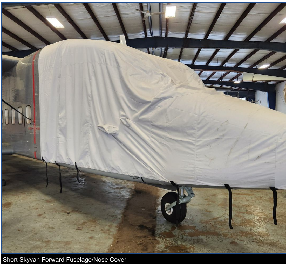
Short Skyvan Forward Fuselage/Nose Cover