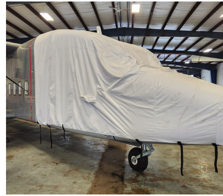
Short Skyvan Forward Fuselage/Nose Cover