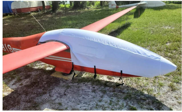
Schweizer SGS 1-35 Canopy/Nose Cover, test fit cover