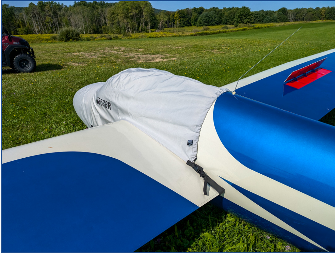
Schweizer 1-23H-15 Canopy/Nose Cover