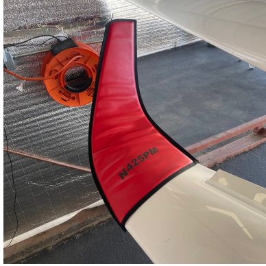
Stemme S-10 & S-12 Wingtip Pads

Designed to prevent damage to the wingtip in crowded hangars or high traffic areas, these products are made of bright red Naugahyde and thickly padded with a sandwich of closed cell foam. Protects delicate winglets, casters and their housings, and soft finishes.