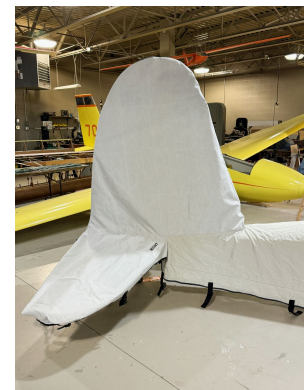
Schweizer 1-26 Empennage Cover