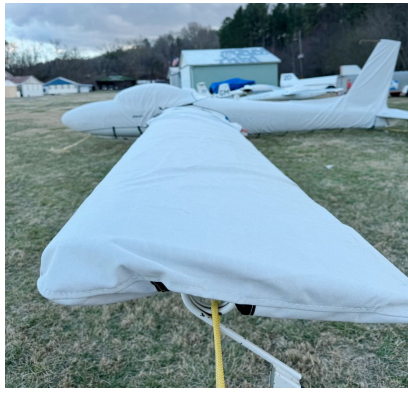
Schweizer SGS 2-32 Complete Cover Set