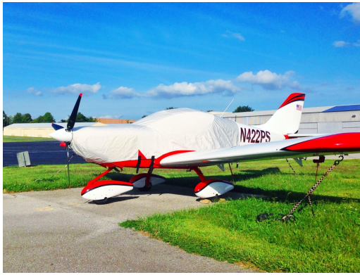
SportCruiser Canopy/Engine Cover