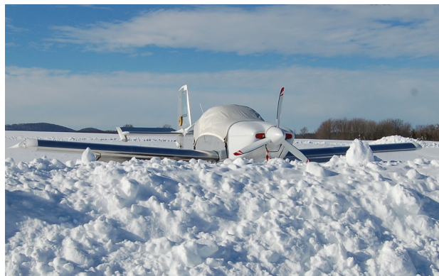
Van's RV-6 Canopy Cover