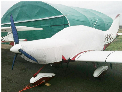
PiperSport Canopy/Engine Cover, Wing Locker Covers

This cover type is made from Silver Acrylic Sunbrella canvas and is 100% lined with a soft and smooth microfiber. Bruce's Custom Covers developed this material combination especially for aircraft protection. The outer material is medium weight and treated for water resistance, UV resistance and anti-static buildup. The inner lining is a very soft and smooth microfiber to prevent scratching. The material is very reflective, and tests show that the cabin interior temperature can be reduced to near-ambient temperature on the hottest of days. It is water, ice and snow repellent, yet breathable to allow moisture to escape from between the cover and the aircraft surface.