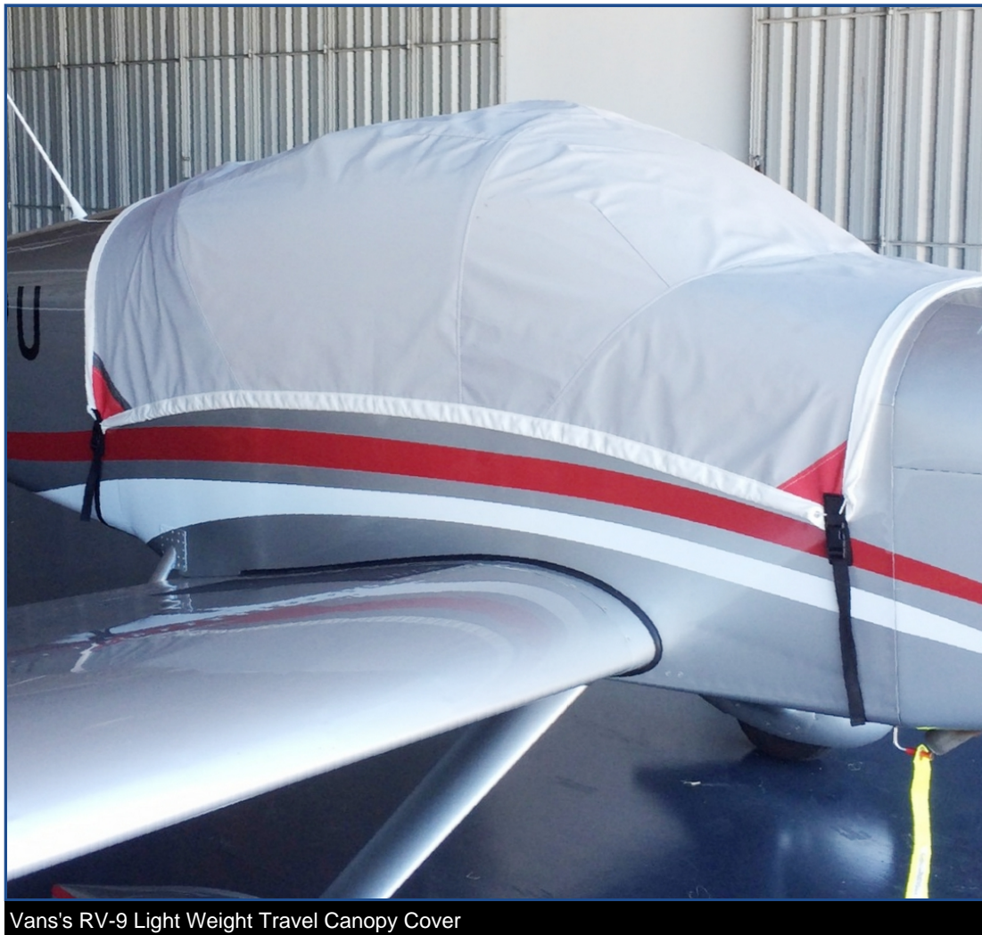
Vans's RV-9 Light Weight Travel Canopy Cover