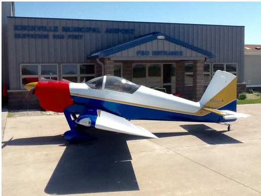
Van's RV-7 Insulated Engine Cover

This cover type is made from Silver Acrylic Sunbrella canvas and is 100% lined with a soft and smooth microfiber. Bruce's Custom Covers developed this material combination especially for aircraft protection. The outer material is medium weight and treated for water resistance, UV resistance and anti-static buildup. The inner lining is a very soft and smooth microfiber to prevent scratching. The material is very reflective, and tests show that the cabin interior temperature can be reduced to near-ambient temperature on the hottest of days. It is water, ice and snow repellent, yet breathable to allow moisture to escape from between the cover and the aircraft surface.