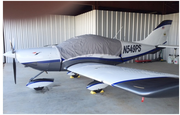
PiperSport Light Weight Travel Cover