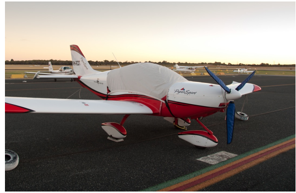
PiperSport Canopy Cover, Engine Plugs