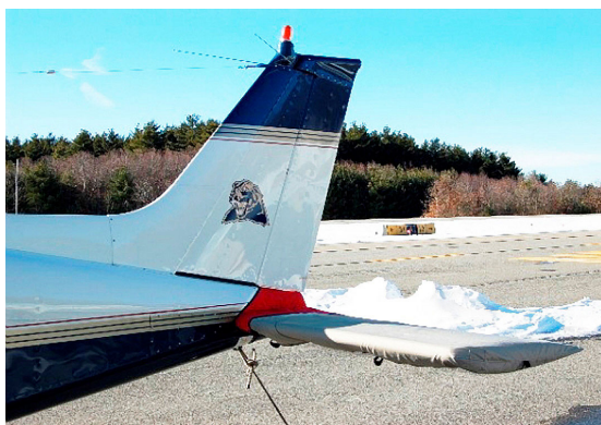
Tailcone & Horizontal Stabilizer Covers