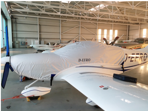
SportCruiser Canopy/Engine Cover