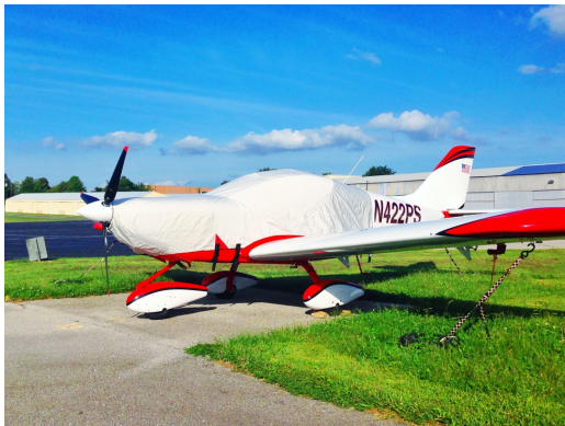
SportCruiser Canopy/Engine Cover

This cover type is made from Silver Acrylic Sunbrella canvas and is 100% lined with a soft and smooth microfiber. Bruce's Custom Covers developed this material combination especially for aircraft protection. The outer material is medium weight and treated for water resistance, UV resistance and anti-static buildup. The inner lining is a very soft and smooth microfiber to prevent scratching. The material is very reflective, and tests show that the cabin interior temperature can be reduced to near-ambient temperature on the hottest of days. It is water, ice and snow repellent, yet breathable to allow moisture to escape from between the cover and the aircraft surface.