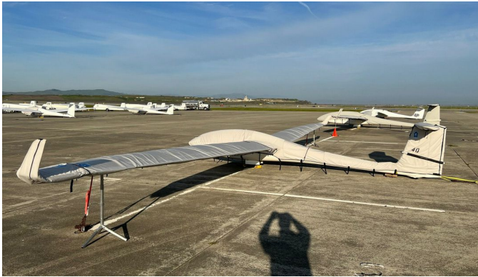
Schempp-Hirth Discus 2B Complete Cover Set

The material is very reflective, and tests show that the cabin interior temperature can be reduced to near-ambient temperature on the hottest of days. It is water, ice and snow repellent, yet breathable to allow moisture to escape from between the cover and the aircraft surface.