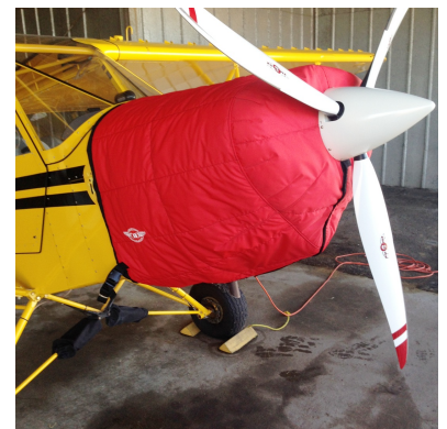
Zlin Savage Insulated Engine Cover