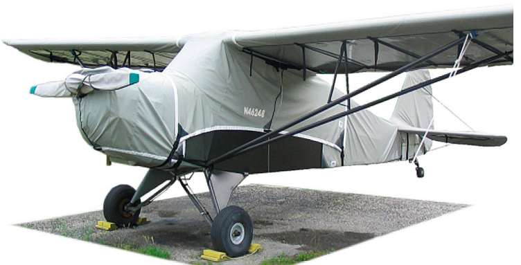
Taylorcraft L-2 Grasshopper Prop, Engine, Canopy, Wing and Empennage Covers