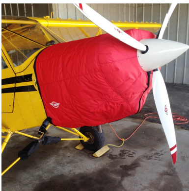
Zlin Savage Insulated Engine Cover

This cover type is made from Silver Acrylic Sunbrella canvas and is 100% lined with a soft and smooth microfiber. Bruce's Custom Covers developed this material combination especially for aircraft protection. The outer material is medium weight and treated for water resistance, UV resistance and anti-static buildup. The inner lining is a very soft and smooth microfiber to prevent scratching. The material is very reflective, and tests show that the cabin interior temperature can be reduced to near-ambient temperature on the hottest of days. It is water, ice and snow repellent, yet breathable to allow moisture to escape from between the cover and the aircraft surface.