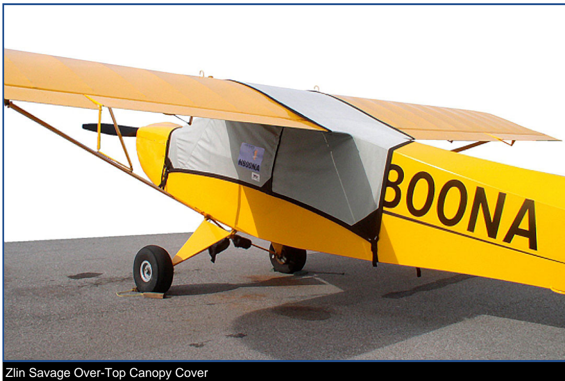
Zlin Savage Over-Top Canopy Cover