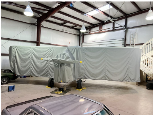
Stearman PT-13 Full Body Dust Cover

Some high value aircraft end up logging lots of hangar time, and become dust magnets in the process. A high quality, well fitting dust cover provides easy assurance that the aircraft's surfaces remain clean and free of grit and grime. Available in a large variety of colors, each dust cover is custom made according to aircraft details and customer preferences. Fire retardant fabrics are also available.