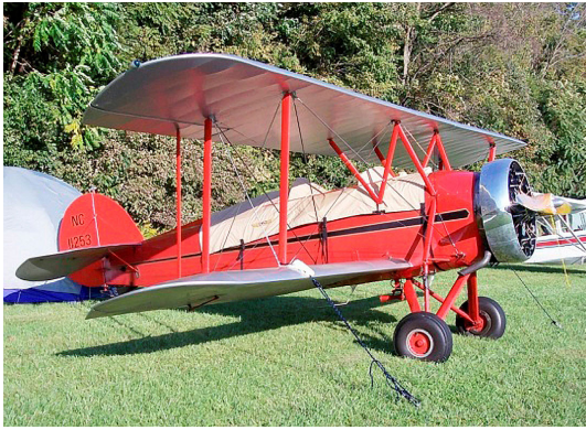
Waco ASO Canopy Cover

the hottest of days. It is water, ice and snow repellent, yet breathable to allow moisture to escape from between the cover and the aircraft surface.