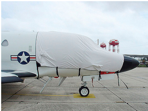
Sabre 40 Cockpit Cover

This cover type is made from Silver Acrylic Sunbrella canvas and is 100% lined with a soft and smooth microfiber. Bruce's Custom Covers developed this material combination especially for aircraft protection. The outer material is medium weight and treated for water resistance, UV resistance and anti-static buildup. The inner lining is a very soft and smooth microfiber to prevent scratching. The material is very reflective, and tests show that the cabin interior temperature can be reduced to near-ambient temperature on the hottest of days. It is water, ice and snow repellent, yet breathable to allow moisture to escape from between the cover and the aircraft surface.