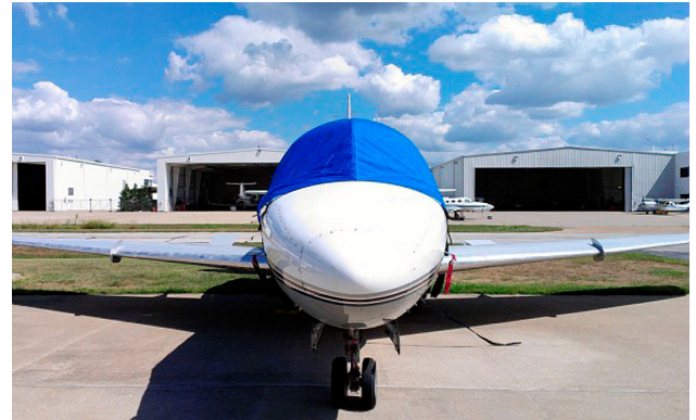
Rockwell Sabre Cockpit/Door Cover