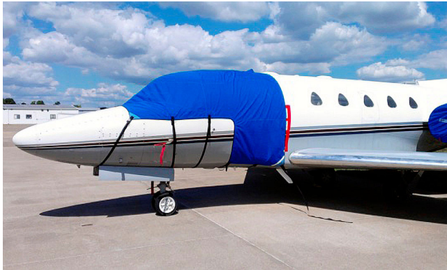
Rockwell Sabre Cockpit/Door Cover

This cover type is made from Silver Acrylic Sunbrella canvas and is 100% lined with a soft and smooth microfiber. Bruce's Custom Covers developed this material combination especially for aircraft protection. The outer material is medium weight and treated for water resistance, UV resistance and anti-static buildup. The inner lining is a very soft and smooth microfiber to prevent scratching. The material is very reflective, and tests show that the cabin interior temperature can be reduced to near-ambient temperature on the hottest of days. It is water, ice and snow repellent, yet breathable to allow moisture to escape from between the cover and the aircraft surface.