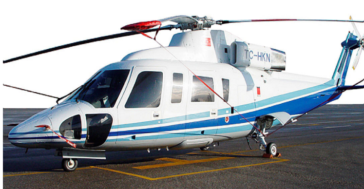
S76 Blade Tie-Downs and Pitot Cover set

WINTER USE MATERIAL - Made with Solution-Dyed Polyester fabric, this option is intended for seasonal use to aid in deicing, rain mitigation, or for occasional travel. The material is lighter and more compact, but more susceptible to UV damage and may have a shorter useful life if used continuously outside than the all-year use material.