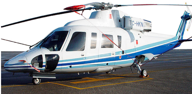
S76 Blade Tie-Downs and Pitot Cover set

WINTER USE MATERIAL - Made with Solution-Dyed Polyester fabric, this option is intended for seasonal use to aid in deicing, rain mitigation, or for occasional travel. The material is lighter and more compact, but more susceptible to UV damage and may have a shorter useful life if used continuously outside than the all-year use material.