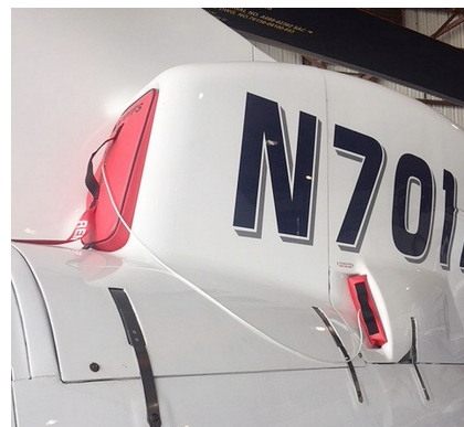
Sikorsky S76 (All Models) Intake Plugs (S76c Models)