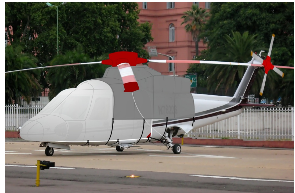
S76 Forward Fuselage, Engine, Main & Tail Rotor Hub Covers (illustration)