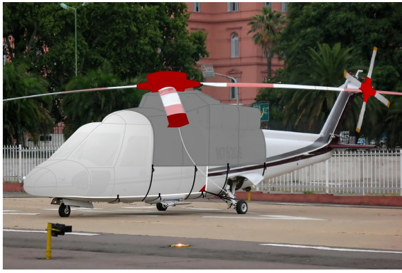
S76 Forward Fuselage, Engine, Main & Tail Rotor Hub Covers (illustration)