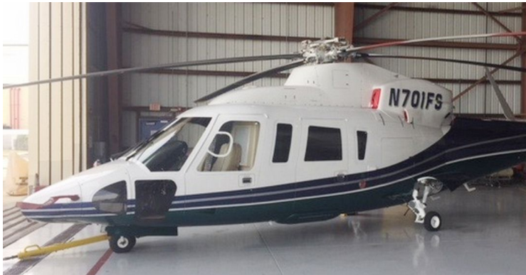
Sikorsky S76 (All Models) Intake Plugs (S76c Models)

The Engine Inlet Plugs are custom fit for your Sikorsky S76 (All Models) intakes, made with heavy-duty vinyl material, and stuffed with a single block of sculpted urethane foam. Each plug has a zipper that allows the foam to be removed and dried if necessary. Engine plugs have 'Remove Before Flight' streamers sewn onto the face of the plugs. Most plugs are imprinted with the aircraft registration number in black for an extra charge. Storage bag NOT included. Engine plugs may be inserted after flight when the engine is still warm. Engine Inlet Plugs are commonly referred to as Cowl Plugs, Intake Plugs, Cowl Blocks, Engine Blocks, and Engine Bungs.