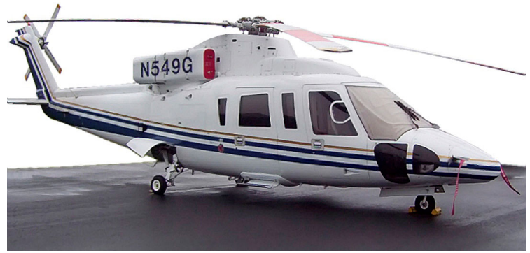
Sikorsky S76 Snap-On Windshield Cover