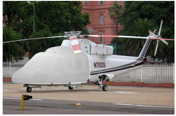
Sikorsky S76 Bubble Cover (Forward Canopy Cover)