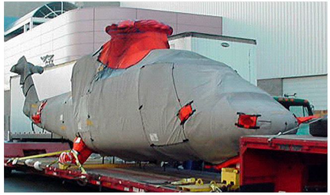
S76 Full Body Transport Cover