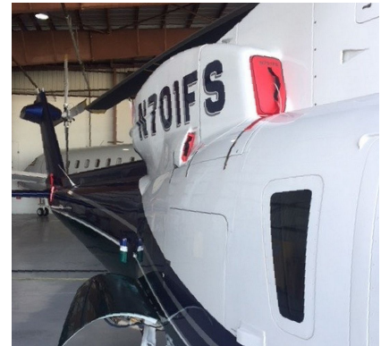
Sikorsky S76 (All Models) Intake Plugs (S76c Models)