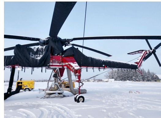
Sikorsky S-64 Skycrane, CH-54 Tarhe Insulated Engine, Rotor Hub, Tailboom, Stabilizer & Tail Rotor Covers