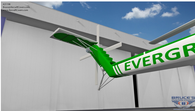
Sikorsky S-64 Canopy/Nose, Engine Area, Blade, Rotor, Tail Rotor Covers (illustration)

The Tailboom Cover details vary by model, but generally the helicopter tail boom cover encloses the tail boom from the "bottleneck" to the aft end. They usually also cover the horizontal stabilizers, and are custom made to allow for antennae, lights, and other protrusions. They attach with straps underneath the tail boom. Covers for the vertical and horizontal stabilizers are also available separately. Specific information for each model is available on request.