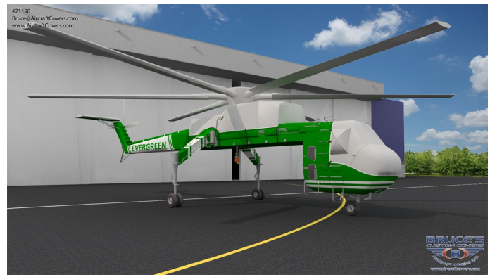
Sikorsky S-64 Canopy/Nose, Engine Area, Blade, Rotor, Tail Rotor Covers (illustration)