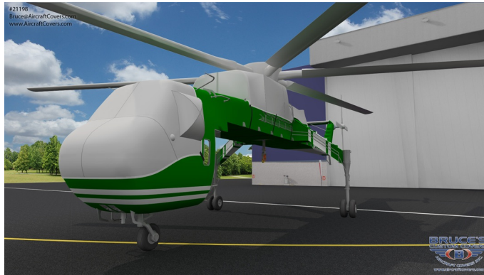
Sikorsky S-64 Canopy/Nose, Engine Area, Blade, Rotor, Tail Rotor Covers (illustration)

Travel Covers are made with Silver Solution-Dyed Polyester fabric and fully lined over the entire cover. The material is lightweight and more compact for easy storage in the aircraft. The polyester material is water resistant, but only intended for occasional use outside. We also have an ultra lightweight material available for fitted hangar dust covers. For daily outdoor use, the non-travel Sunbrella Cover is the best choice.