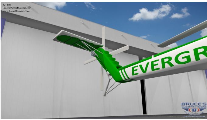
Sikorsky S-64 Canopy/Nose, Engine Area, Blade, Rotor, Tail Rotor Covers (illustration)