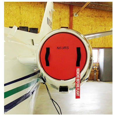
Cessna Citation S2 Intake Plugs