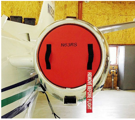
Cessna Citation S-550 Intake Plugs