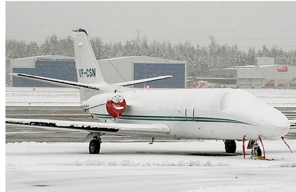
Cessna 560 Engine Inlet/Exhaust Covers, Pitot Cover Set