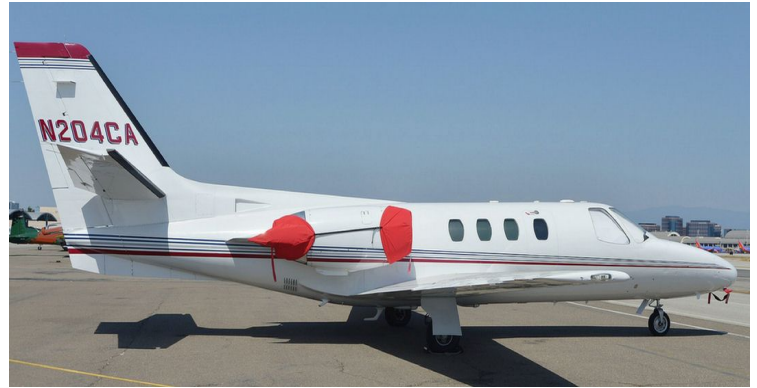
Cessna Citation Engine Covers and Heatshields