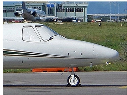
Cessna Citation S550 Cockpit HeatShields