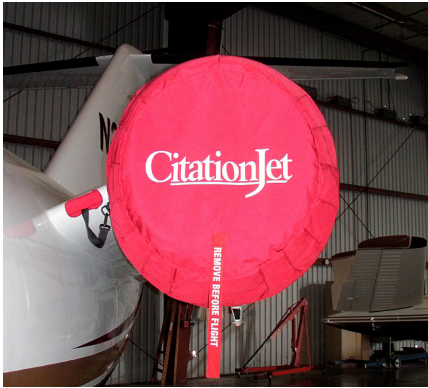
Cessna Citation Engine Cover Set

and dried if necessary. Engine plugs have 'remove before flight' streamers sewn onto the face of the plugs. Most plugs are imprinted with the aircraft registration number in black. Engine plugs may be inserted after flight when the engine is still warm. Engine Inlet Plugs are commonly referred to as Cowl Plugs, Intake Plugs, Cowl Blocks, Engine Blocks, and Engine Bungs.