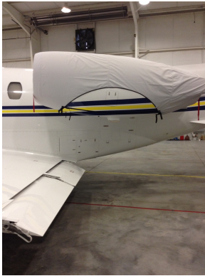
Cessna Citation 560XL Upper Nacelle/Brightwork Covers

and dried if necessary. Engine plugs have 'remove before flight' streamers sewn onto the face of the plugs. Most plugs are imprinted with the aircraft registration number in black. Engine plugs may be inserted after flight when the engine is still warm. Engine Inlet Plugs are commonly referred to as Cowl Plugs, Intake Plugs, Cowl Blocks, Engine Blocks, and Engine Bungs.