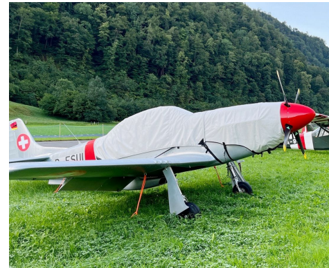
Stewart S-51 Canopy & Engine Covers