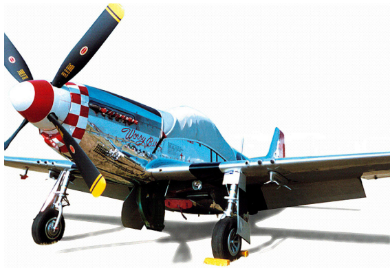
Canopy Cover, Belly & Chin Scoop Plugs

Covers developed this material combination especially for aircraft protection. The outer material is medium weight and treated for water resistance, UV resistance and anti-static buildup. The inner lining is a very soft and smooth microfiber to prevent scratching. The material is very reflective, and tests show that the cabin interior temperature can be reduced to near-ambient temperature on the hottest of days. It is water, ice and snow repellent, yet breathable to allow moisture to escape from between the cover and the aircraft surface.