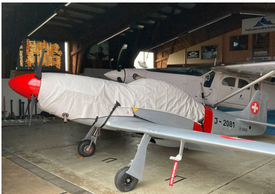
SW-51 Mustang Canopy & Engine Covers