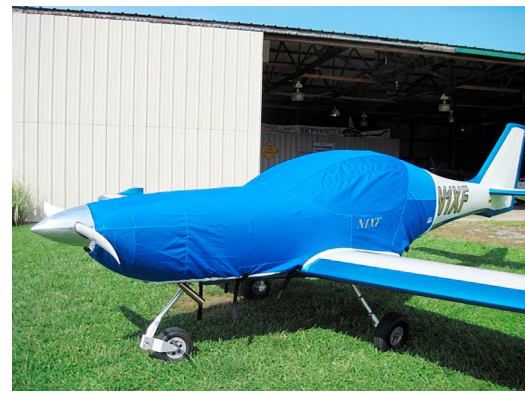
Arion Lightning Extended Canopy/Engine Cover