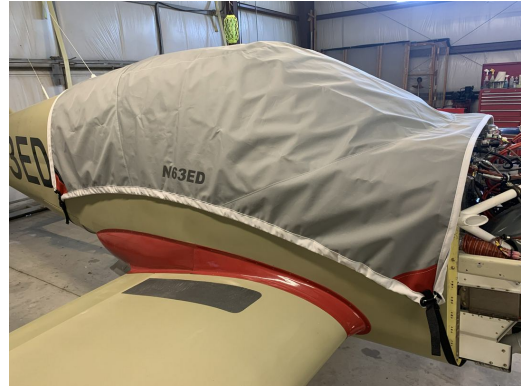
Swearingen SX300 Travel Weight Canopy Cover