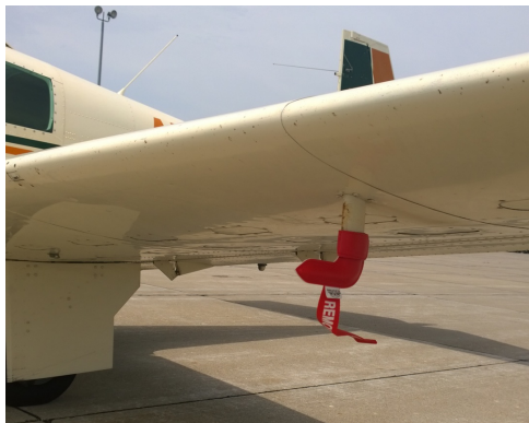
Mooney Pitot Cover

Engine Inlet Plugs are custom fit for your Swearingen SX300 intakes, made with heavy-duty vinyl material, and stuffed with a single block of sculpted urethane foam. Each plug has a zipper that allows the foam to be removed and dried if necessary. Engine plugs have warning flags that are visible from the cockpit or 'remove before flight' streamers sewn onto the face of the plugs. Most plugs are imprinted with the aircraft registration number in black for an extra charge. Storage bag NOT included. Engine plugs may be inserted after flight when the engine is still warm. Engine Inlet Plugs are commonly referred to as Cowl Plugs, Intake Plugs, Cowl Blocks, Engine Blocks, and Engine Bungs.