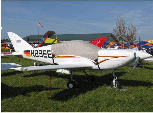
The Swearingen SX300 Canopy Cover

Travel Covers are made with Silver Solution-Dyed Polyester fabric and only lined over the windshield to save weight. The material is lightweight and more compact for easy stowage in the aircraft. The polyester material is water resistant, but only intended for occasional use outside. We also have an ultra lightweight material available for fitted hangar dust covers. For daily outdoor use, the non-travel Sunbrella Cover is the best choice.