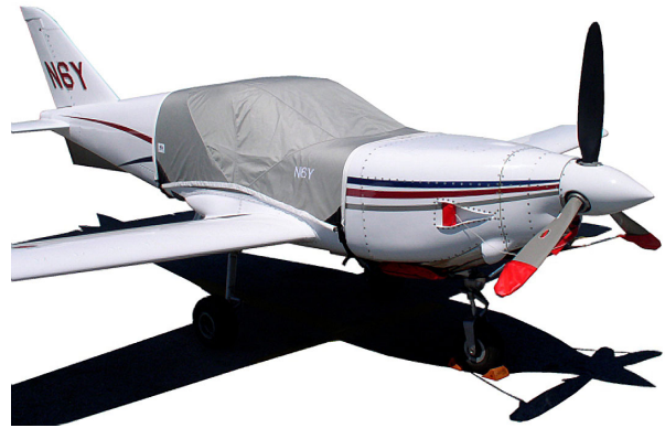
The Swearingen SX300 Canopy Cover, Engine Plugs & Prop Ties