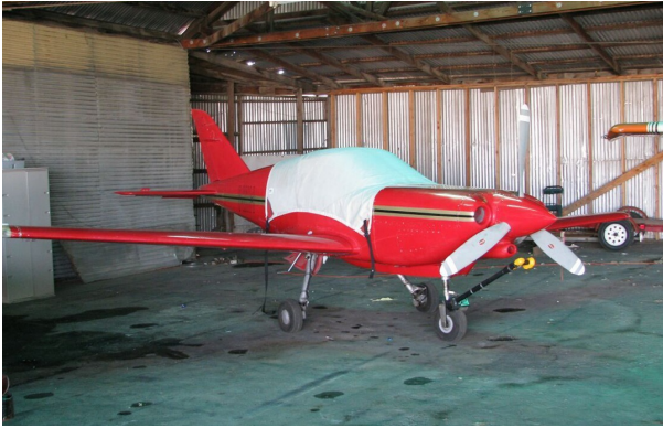
The Swearingen SX300 Canopy Cover