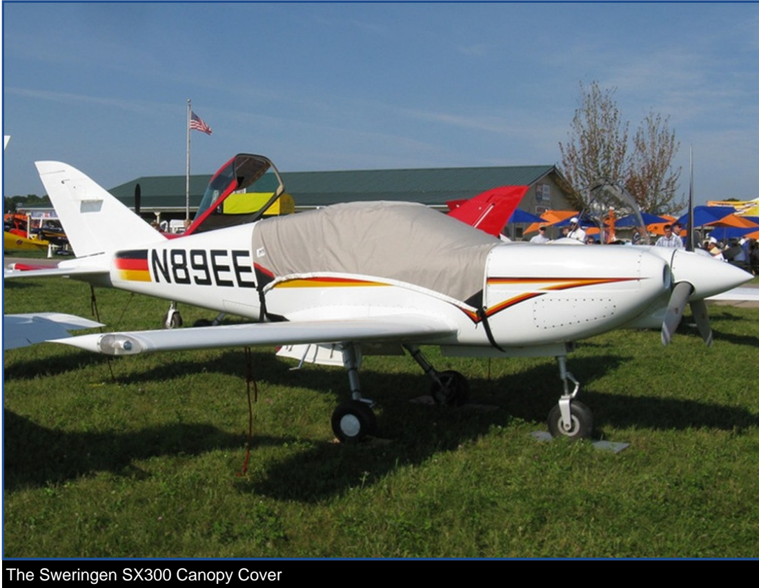
The Swearingen SX300 Canopy Cover