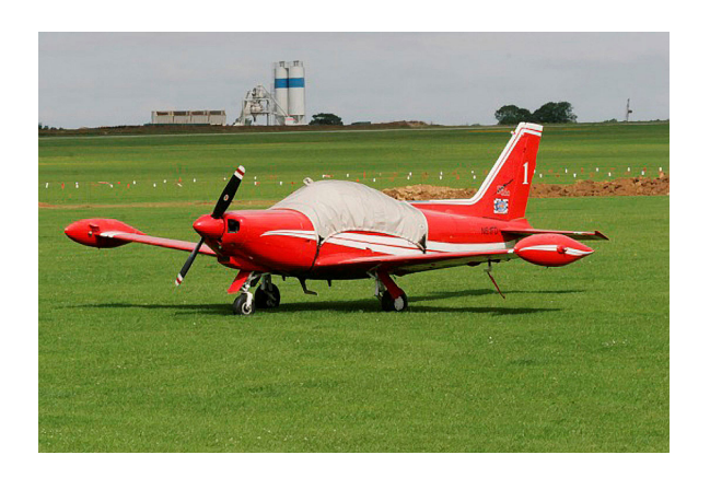
Siai Marchetti SF260 Canopy Cover