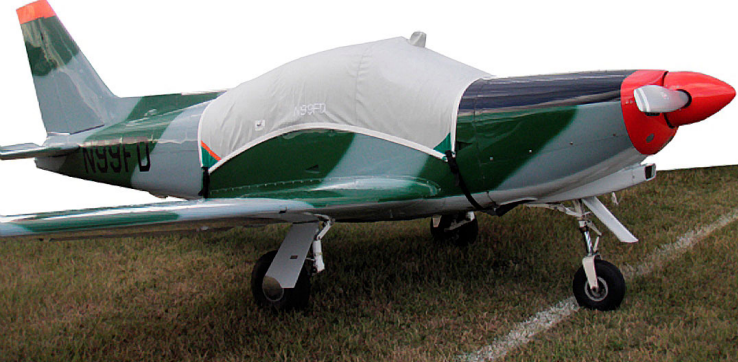
Standard Canopy Cover