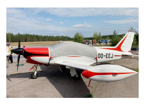
Siai Marchetti SF260 Light Weight Travel Canopy Cover

Travel Covers are made with Silver Solution-Dyed Polyester fabric and only lined over the windshield to save weight. The material is lightweight and more compact for easy stowage in the aircraft. The polyester material is water resistant, but only intended for occasional use outside. We also have an ultra lightweight material available for fitted hangar dust covers. For daily outdoor use, the non-travel Sunbrella Cover is the best choice.