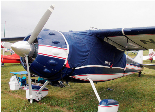
Cessna 195 Canopy Cover, extended forward and over gas caps

The material is very reflective, and tests show that the cabin interior temperature can be reduced to near-ambient temperature on the hottest of days. It is water, ice and snow repellent, yet breathable to allow moisture to escape from between the cover and the aircraft surface.