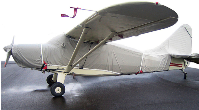
Stinson 108 Canopy, Engine, Prop & Empennage Covers

The material is very reflective, and tests show that the cabin interior temperature can be reduced to near-ambient temperature on the hottest of days. It is water, ice and snow repellent, yet breathable to allow moisture to escape from between the cover and the aircraft surface.