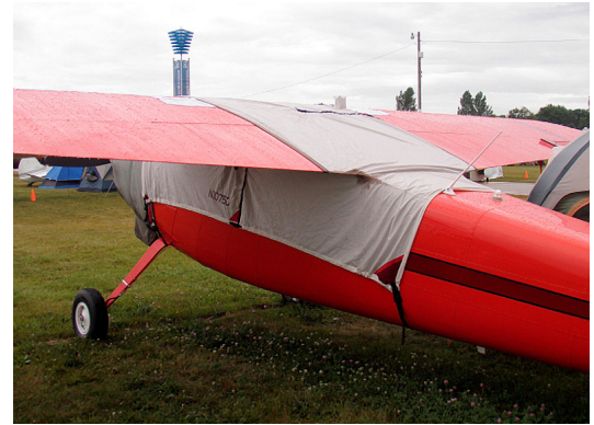
Over-Top Canopy Cover & Engine Cover