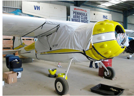
Cessna 195 Canopy Cover, over-top, 24" fwd ext to cover cowl ring gap, gas cap ext.