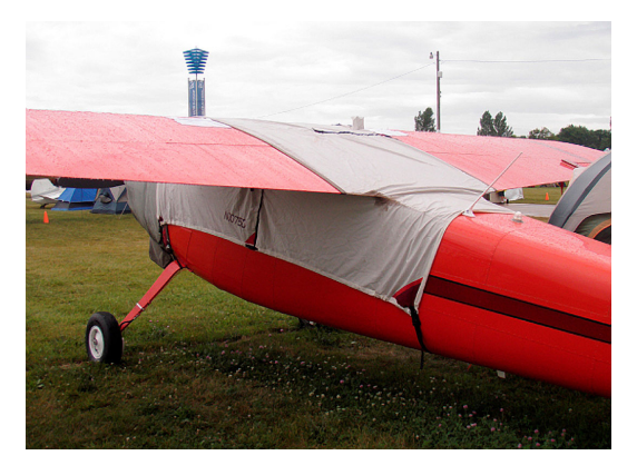
Over-Top Canopy Cover & Engine Cover

The material is very reflective, and tests show that the cabin interior temperature can be reduced to near-ambient temperature on the hottest of days. It is water, ice and snow repellent, yet breathable to allow moisture to escape from between the cover and the aircraft surface.