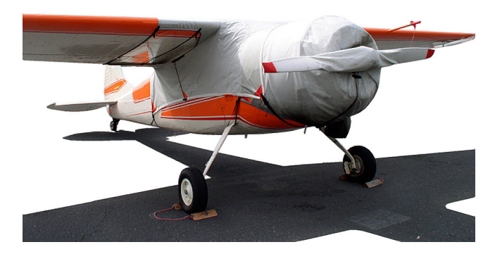
Cessna 195 Over-Top Canopy, Engine & Prop Covers