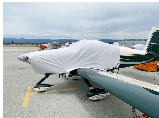
Van's RV-9A Extended Canopy/Engine Cover