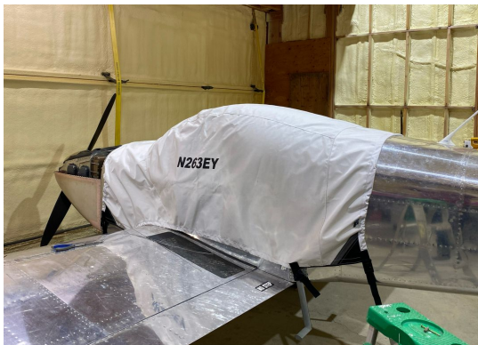
Van's RV-9A Extended Canopy Cover

This cover type is made from Silver Acrylic Sunbrella canvas and is 100% lined with a soft and smooth microfiber. Bruce's Custom Covers developed this material combination especially for aircraft protection. The outer material is medium weight and treated for water resistance, UV resistance and anti-static buildup. The inner lining is a very soft and smooth microfiber to prevent scratching. The material is very reflective, and tests show that the cabin interior temperature can be reduced to near-ambient temperature on the hottest of days. It is water, ice and snow repellent, yet breathable to allow moisture to escape from between the cover and the aircraft surface.