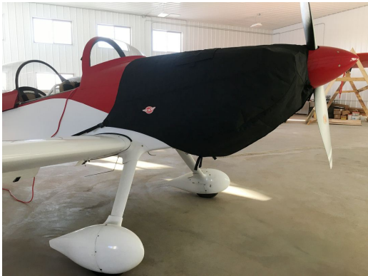
Van's RV-8 Insulated Engine Cover

This cover type is made from Silver Acrylic Sunbrella canvas and is 100% lined with a soft and smooth microfiber. Bruce's Custom Covers developed this material combination especially for aircraft protection. The outer material is medium weight and treated for water resistance, UV resistance and anti-static buildup. The inner lining is a very soft and smooth microfiber to prevent scratching. The material is very reflective, and tests show that the cabin interior temperature can be reduced to near-ambient temperature on the hottest of days. It is water, ice and snow repellent, yet breathable to allow moisture to escape from between the cover and the aircraft surface.