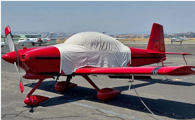
Van's RV-8A Extended Canopy Cover