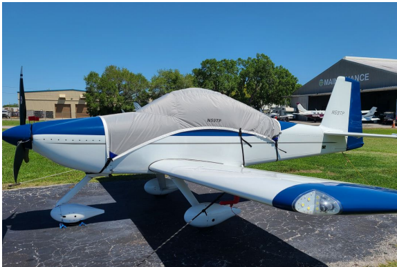
Van's RV-8 Canopy Cover, 3RD BELLY STRAP OPTIONAL

This cover type is made from Silver Acrylic Sunbrella canvas and is 100% lined with a soft and smooth microfiber. Bruce's Custom Covers developed this material combination especially for aircraft protection. The outer material is medium weight and treated for water resistance, UV resistance and anti-static buildup. The inner lining is a very soft and smooth microfiber to prevent scratching. The material is very reflective, and tests show that the cabin interior temperature can be reduced to near-ambient temperature on the hottest of days. It is water, ice and snow repellent, yet breathable to allow moisture to escape from between the cover and the aircraft surface.