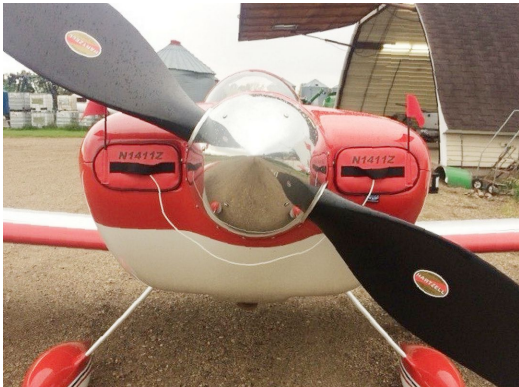
Van's RV-8 Engine Plugs