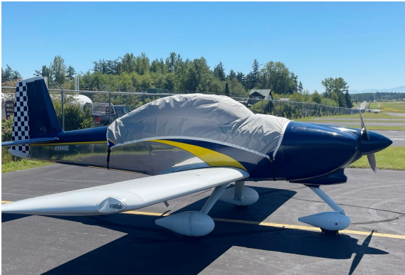
RV-8A Travel Canopy Cover