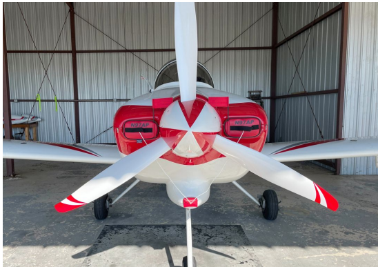
Van's RV-8 Engine Inlet Plugs

Engine Inlet Plugs are custom fit for your Van's Aircraft RV-8/8A intakes, made with heavy-duty vinyl material, and stuffed with a single block of sculpted urethane foam. Each plug has a zipper that allows the foam to be removed and dried if necessary. Engine plugs have warning flags that are visible from the cockpit or 'remove before flight' streamers sewn onto the face of the plugs. Most plugs are imprinted with the aircraft registration number in black for an extra charge. Storage bag NOT included. Engine plugs may be inserted after flight when the engine is still warm. Engine Inlet Plugs are commonly referred to as Cowl Plugs, Intake Plugs, Cowl Blocks, Engine Blocks, and Engine Bungs.