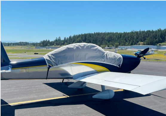
RV-8A Travel Canopy Cover

Travel Covers are made with Silver Solution-Dyed Polyester fabric and only lined over the windshield to save weight. The material is lightweight and more compact for easy stowage in the aircraft. The polyester material is water resistant, but only intended for occasional use outside. We also have an ultra lightweight material available for fitted hangar dust covers. For daily outdoor use, the non-travel Sunbrella Cover is the best choice.