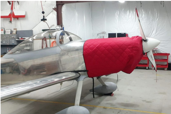
Van's Aircraft RV-8/8A Insulated Hangar Blanket, Interior Use