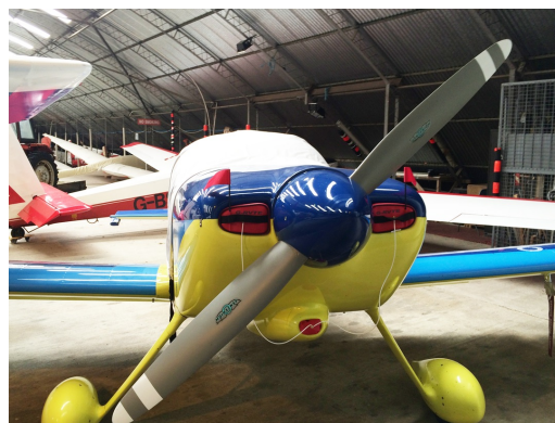
Van's RV-6 Engine Inlet Plugs