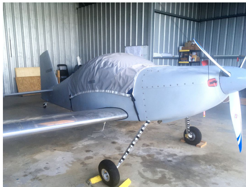
Van's RV-7 Travel Cover, Light Weight Canopy Cover