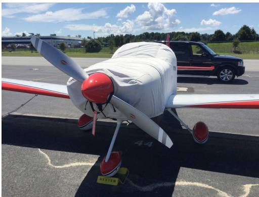
Van's RV-6A Extended Canopy/Engine Cover

This cover type is made from Silver Acrylic Sunbrella canvas and is 100% lined with a soft and smooth microfiber. Bruce's Custom Covers developed this material combination especially for aircraft protection. The outer material is medium weight and treated for water resistance, UV resistance and anti-static buildup. The inner lining is a very soft and smooth microfiber to prevent scratching. The material is very reflective, and tests show that the cabin interior temperature can be reduced to near-ambient temperature on the hottest of days. It is water, ice and snow repellent, yet breathable to allow moisture to escape from between the cover and the aircraft surface.