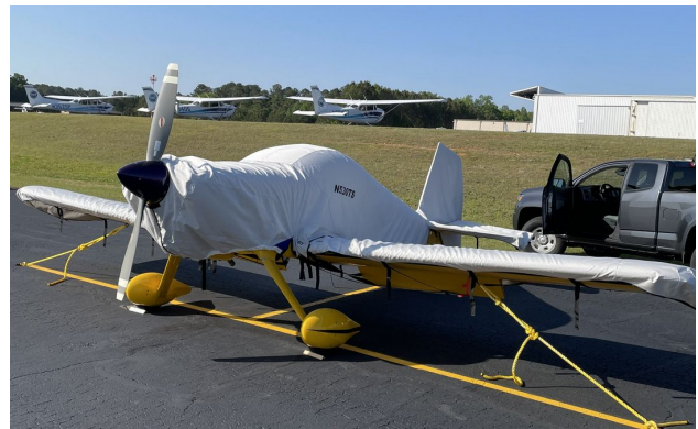
RV7 Complete fuselage cover w/detachable wing covers