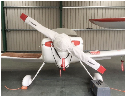
Van's RV-6 Prop/Spinner Cover