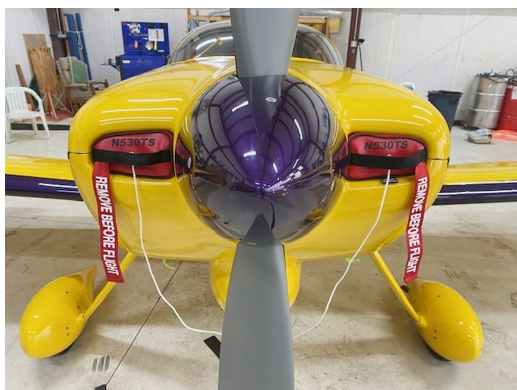
Van's Aircraft RV-7 Engine Inlet Plugs