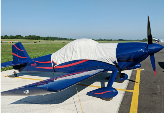
Van's RV-3 Canopy Cover

This cover type is made from Silver Acrylic Sunbrella canvas and is 100% lined with a soft and smooth microfiber. Bruce's Custom Covers developed this material combination especially for aircraft protection. The outer material is medium weight and treated for water resistance, UV resistance and anti-static buildup. The inner lining is a very soft and smooth microfiber to prevent scratching. The material is very reflective, and tests show that the cabin interior temperature can be reduced to near-ambient temperature on the hottest of days. It is water, ice and snow repellent, yet breathable to allow moisture to escape from between the cover and the aircraft surface.