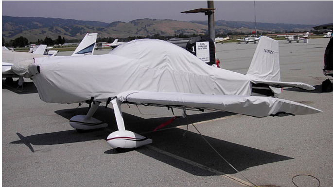
Van's RV-8 Complete Fuselage Cover w/ Detachable Wing Covers & Prop Cover

This cover type is made from Silver Acrylic Sunbrella canvas and is 100% lined with a soft and smooth microfiber. Bruce's Custom Covers developed this material combination especially for aircraft protection. The outer material is medium weight and treated for water resistance, UV resistance and anti-static buildup. The inner lining is a very soft and smooth microfiber to prevent scratching. The material is very reflective, and tests show that the cabin interior temperature can be reduced to near-ambient temperature on the hottest of days. It is water, ice and snow repellent, yet breathable to allow moisture to escape from between the cover and the aircraft surface.