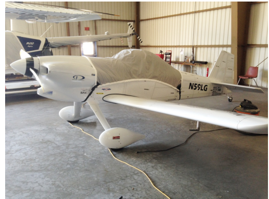
Van's RV-3 Light Weight Travel Cover