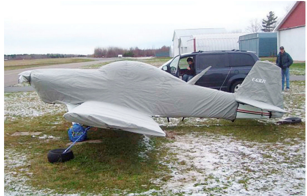
Van's RV-4 Complete Fuselage/Wing/Tail Surfaces cover