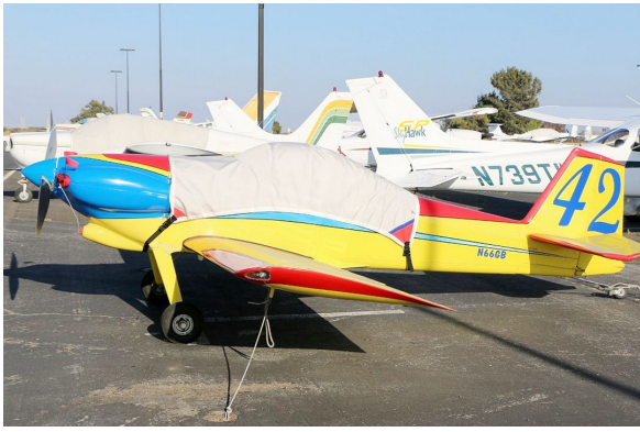
Van's RV-3 Canopy Cover and Engine Plugs