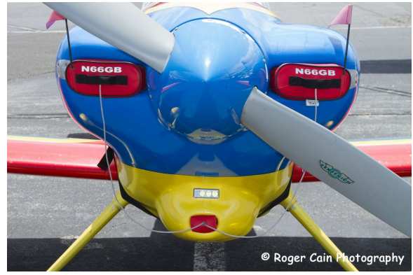
Van's RV-3 Engine Plugs