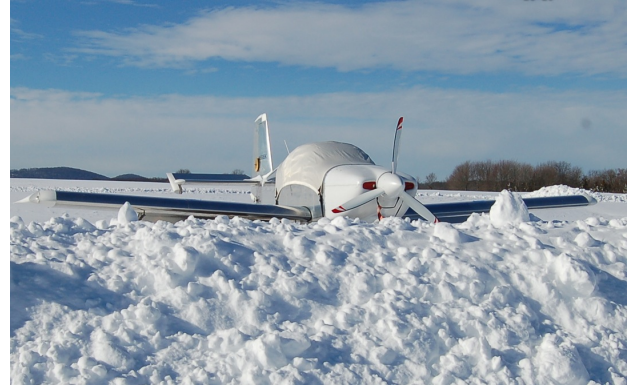
Van's RV-6 Canopy Cover