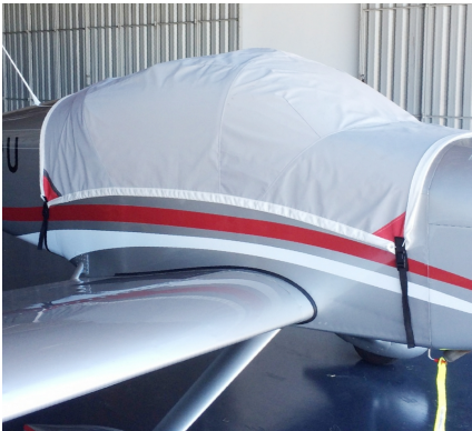
Vans's RV-9 Light Weight Travel Canopy Cover

Travel Covers are made with Silver Solution-Dyed Polyester fabric and only lined over the windshield to save weight. The material is lightweight and more compact for easy stowage in the aircraft. The polyester material is water resistant, but only intended for occasional use outside. We also have an ultra lightweight material available for fitted hangar dust covers. For daily outdoor use, the non-travel Sunbrella Cover is the best choice.