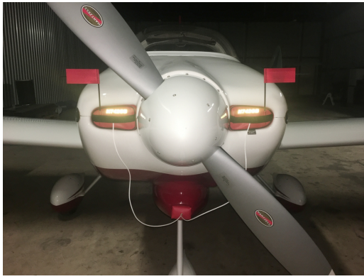
Van's Aircraft RV-7A Engine Inlet Plugs