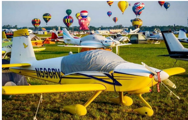
Vans's RV-9 Travel Weight Canopy Cover at Sun 'n Fun

Travel Covers are made with Silver Solution-Dyed Polyester fabric and only lined over the windshield to save weight. The material is lightweight and more compact for easy stowage in the aircraft. The polyester material is water resistant, but only intended for occasional use outside. We also have an ultra lightweight material available for fitted hangar dust covers. For daily outdoor use, the non-travel Sunbrella Cover is the best choice.