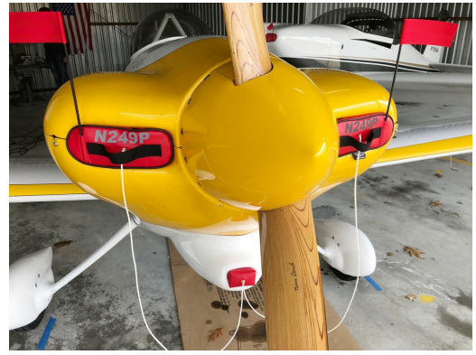
Van's RV-4 Engine Inlet Plugs