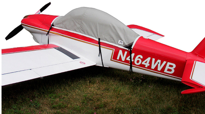
Vans's RV-3 Canopy Cover

This cover type is made from Silver Acrylic Sunbrella canvas and is 100% lined with a soft and smooth microfiber. Bruce's Custom Covers developed this material combination especially for aircraft protection. The outer material is medium weight and treated for water resistance, UV resistance and anti-static buildup. The inner lining is a very soft and smooth microfiber to prevent scratching. The material is very reflective, and tests show that the cabin interior temperature can be reduced to near-ambient temperature on the hottest of days. It is water, ice and snow repellent, yet breathable to allow moisture to escape from between the cover and the aircraft surface.