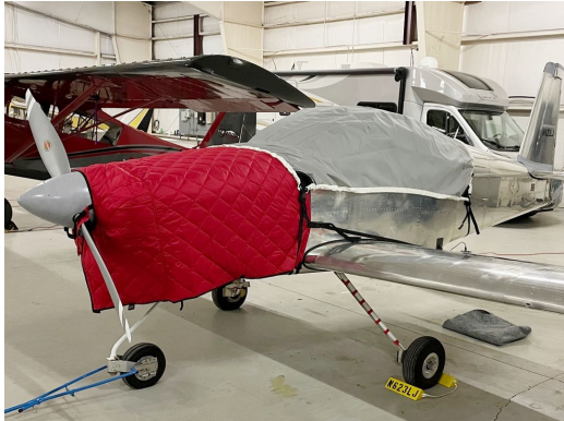
Vans RV-7 Travel Canopy Cover, Hangar Blanket

This cover type is made from Silver Acrylic Sunbrella canvas and is 100% lined with a soft and smooth microfiber. Bruce's Custom Covers developed this material combination especially for aircraft protection. The outer material is medium weight and treated for water resistance, UV resistance and anti-static buildup. The inner lining is a very soft and smooth microfiber to prevent scratching. The material is very reflective, and tests show that the cabin interior temperature can be reduced to near-ambient temperature on the hottest of days. It is water, ice and snow repellent, yet breathable to allow moisture to escape from between the cover and the aircraft surface.