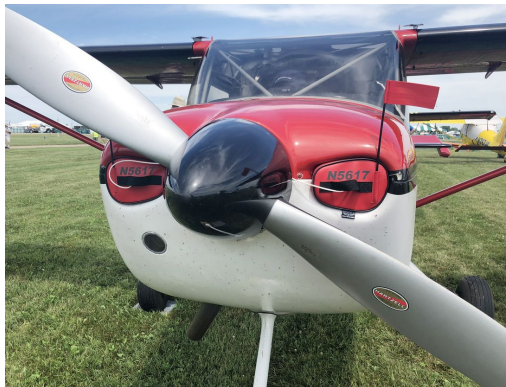
Glaster Engine Plugs

Engine Inlet Plugs are custom fit for your Van's Aircraft RV-15 intakes, made with heavy-duty vinyl material, and stuffed with a single block of sculpted urethane foam. Each plug has a zipper that allows the foam to be removed and dried if necessary. Engine plugs have warning flags that are visible from the cockpit or 'remove before flight' streamers sewn onto the face of the plugs. Most plugs are imprinted with the aircraft registration number in black for an extra charge. Storage bag NOT included. Engine plugs may be inserted after flight when the engine is still warm. Engine Inlet Plugs are commonly referred to as Cowl Plugs, Intake Plugs, Cowl Blocks, Engine Blocks, and Engine Bungs.