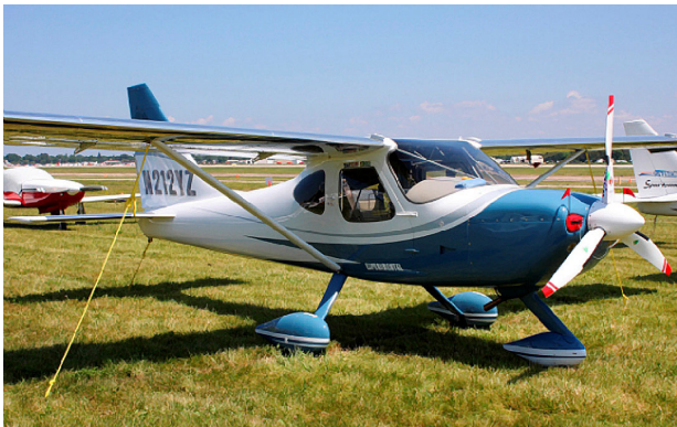
Glastar Sportsman Engine Inlet Plugs