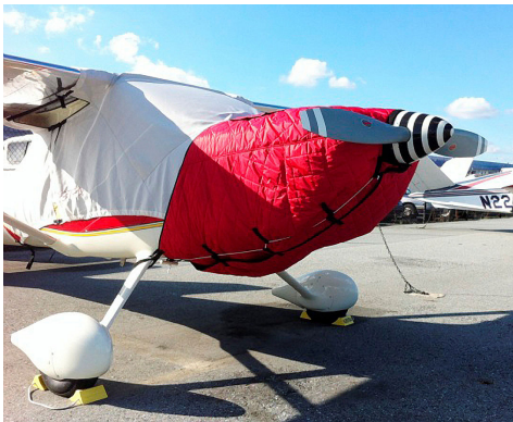
Glastar Insulated Engine Cover

This cover type is made from Silver Acrylic Sunbrella canvas and is 100% lined with a soft and smooth microfiber. Bruce's Custom Covers developed this material combination especially for aircraft protection. The outer material is medium weight and treated for water resistance, UV resistance and anti-static buildup. The inner lining is a very soft and smooth microfiber to prevent scratching. The material is very reflective, and tests show that the cabin interior temperature can be reduced to near-ambient temperature on the hottest of days. It is water, ice and snow repellent, yet breathable to allow moisture to escape from between the cover and the aircraft surface.