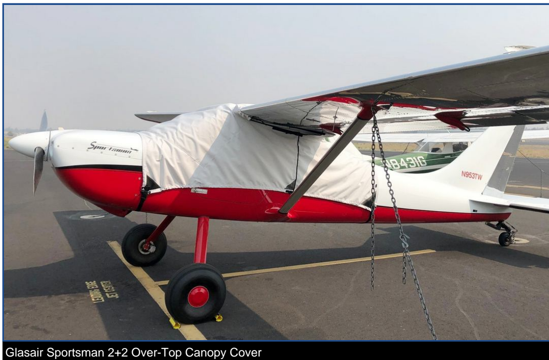
Glasair Sportsman 2+2 Over-Top Canopy Cover