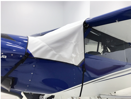
Cub Crafters CC-11 Windshield Cover

This cover type is made from Silver Acrylic Sunbrella canvas and is 100% lined with a soft and smooth microfiber. Bruce's Custom Covers developed this material combination especially for aircraft protection. The outer material is medium weight and treated for water resistance, UV resistance and anti-static buildup. The inner lining is a very soft and smooth microfiber to prevent scratching. The material is very reflective, and tests show that the cabin interior temperature can be reduced to near-ambient temperature on the hottest of days. It is water, ice and snow repellent, yet breathable to allow moisture to escape from between the cover and the aircraft surface.