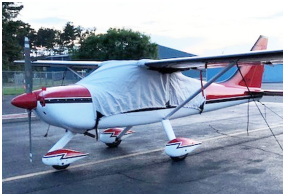
Glasair Aviation Glastar, Sportsman 2+2 Canopy Cover (Over-The-Top Style)