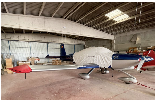
Van's RV-10 Extended Canopy Cover, Wingtip Pads

Designed to prevent damage to the aircraft extremities in crowded hangars, these products are made of bright red Naugahyde and thickly padded with a sandwich of closed cell foam.