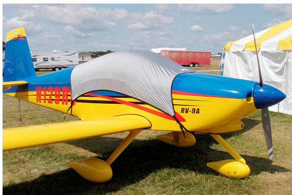
Van's RV-9A Light Weight Travel-Cover

Travel Covers are made with Silver Solution-Dyed Polyester fabric and only lined over the windshield to save weight. The material is lightweight and more compact for easy stowage in the aircraft. The polyester material is water resistant, but only intended for occasional use outside. We also have an ultra lightweight material available for fitted hangar dust covers. For daily outdoor use, the non-travel Sunbrella Cover is the best choice.