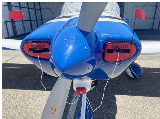
Van's RV-10 Engine Inlet Plugs

Engine Inlet Plugs are custom fit for your Van's Aircraft RV-10 intakes, made with heavy-duty vinyl material, and stuffed with a single block of sculpted urethane foam. Each plug has a zipper that allows the foam to be removed and dried if necessary. Engine plugs have warning flags that are visible from the cockpit or 'remove before flight' streamers sewn onto the face of the plugs. Most plugs are imprinted with the aircraft registration number in black for an extra charge. Storage bag NOT included. Engine plugs may be inserted after flight when the engine is still warm. Engine Inlet Plugs are commonly referred to as Cowl Plugs, Intake Plugs, Cowl Blocks, Engine Blocks, and Engine Bungs.