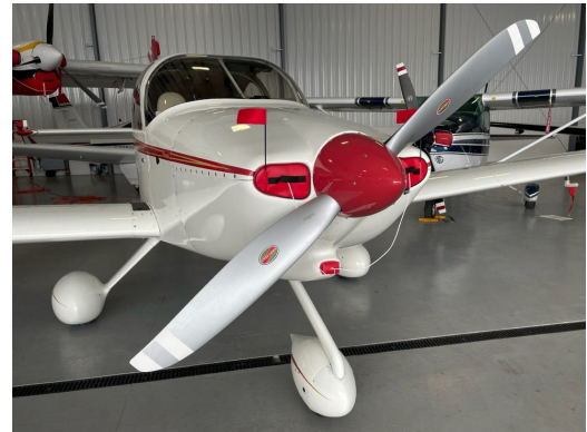
Van's RV-10 Engine Inlet Plugs