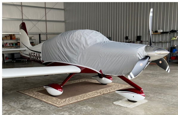
Van's RV-10 Travel Cover