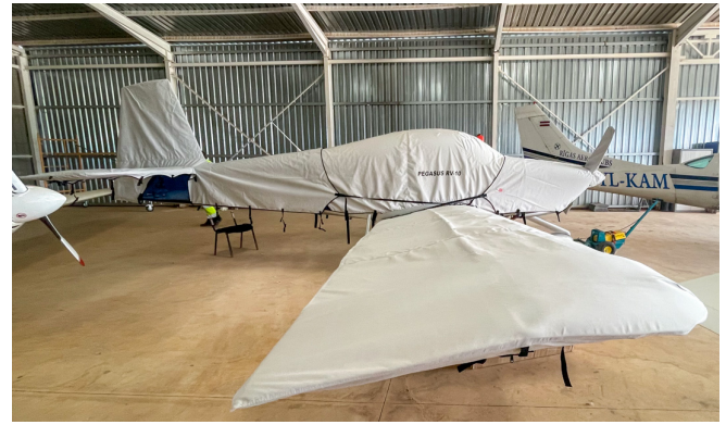
Van's RV-10 Full Cover Set