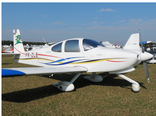
Van's RV-10 HeatShield Set