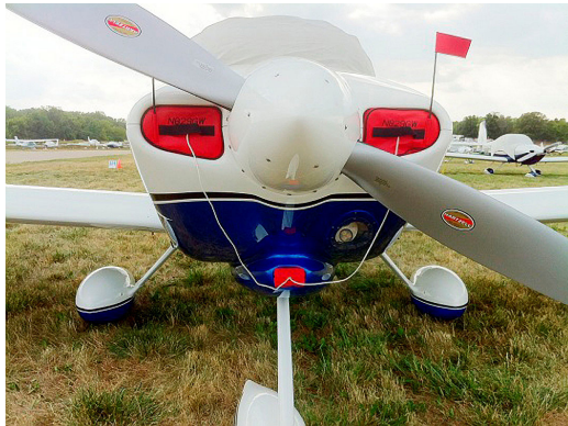
Van's RV-10 Canopy Cover & Engine Inlet Plugs

Engine Inlet Plugs are custom fit for your Van's Aircraft RV-10 intakes, made with heavy-duty vinyl material, and stuffed with a single block of sculpted urethane foam. Each plug has a zipper that allows the foam to be removed and dried if necessary. Engine plugs have warning flags that are visible from the cockpit or 'remove before flight' streamers sewn onto the face of the plugs. Most plugs are imprinted with the aircraft registration number in black for an extra charge. Storage bag NOT included. Engine plugs may be inserted after flight when the engine is still warm. Engine Inlet Plugs are commonly referred to as Cowl Plugs, Intake Plugs, Cowl Blocks, Engine Blocks, and Engine Bunges.