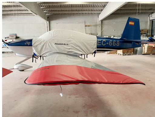
Van's RV-10 Extended Canopy Cover, Wingtip Pads