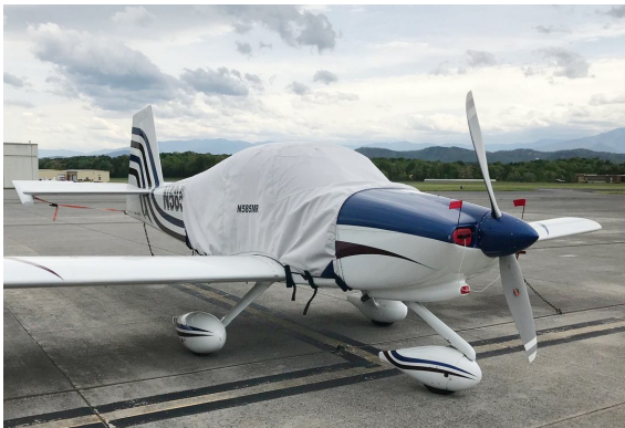
Van's RV-10 Extended Canopy Cover