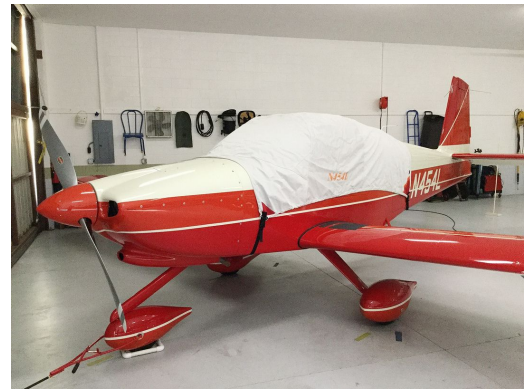
Van's Aircraft RV-10 Canopy Cover