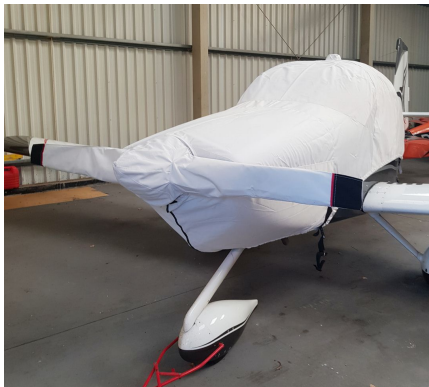
Van's RV-10 Canopy/Engine Cover

This cover type is made from Silver Acrylic Sunbrella canvas and is 100% lined with a soft and smooth microfiber. Bruce's Custom Covers developed this material combination especially for aircraft protection. The outer material is medium weight and treated for water resistance, UV resistance and anti-static buildup. The inner lining is a very soft and smooth microfiber to prevent scratching. The material is very reflective, and tests show that the cabin interior temperature can be reduced to near-ambient temperature on the hottest of days. It is water, ice and snow repellent, yet breathable to allow moisture to escape from between the cover and the aircraft surface.