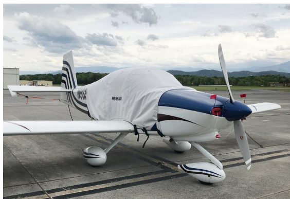
Van's RV-10 Extended Canopy Cover