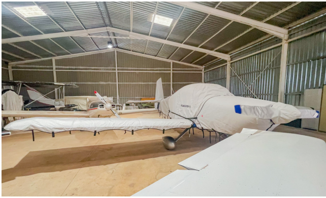
Van's RV-10 Full Cover Set