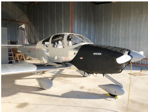
Van's RV-10 Fully Enclosed Insulated Engine Cover

This cover type is made from Silver Acrylic Sunbrella canvas and is 100% lined with a soft and smooth microfiber. Bruce's Custom Covers developed this material combination especially for aircraft protection. The outer material is medium weight and treated for water resistance, UV resistance and anti-static buildup. The inner lining is a very soft and smooth microfiber to prevent scratching. The material is very reflective, and tests show that the cabin interior temperature can be reduced to near-ambient temperature on the hottest of days. It is water, ice and snow repellent, yet breathable to allow moisture to escape from between the cover and the aircraft surface.