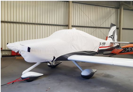
Van's RV-10 Propellor/Spinner Cover

This cover type is made from Silver Acrylic Sunbrella canvas and is 100% lined with a soft and smooth microfiber. Bruce's Custom Covers developed this material combination especially for aircraft protection. The outer material is medium weight and treated for water resistance, UV resistance and anti-static buildup. The inner lining is a very soft and smooth microfiber to prevent scratching. The material is very reflective, and tests show that the cabin interior temperature can be reduced to near-ambient temperature on the hottest of days. It is water, ice and snow repellent, yet breathable to allow moisture to escape from between the cover and the aircraft surface.