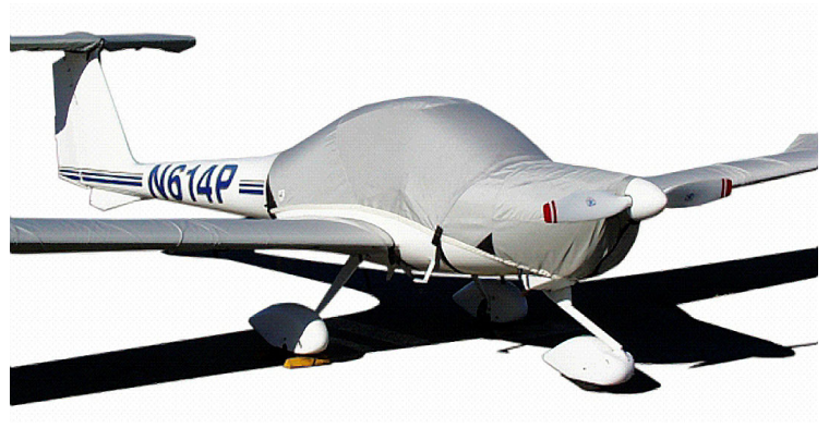
Diamond DA-20 Canopy/Engine, Wing & Horiz. Stab. Covers