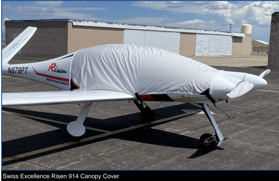
Swiss Excellence Risen 914 Canopy Cover