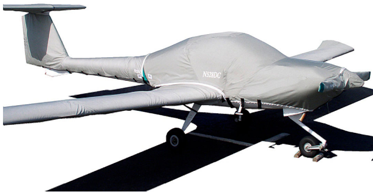
DA-20 Full Cover Set