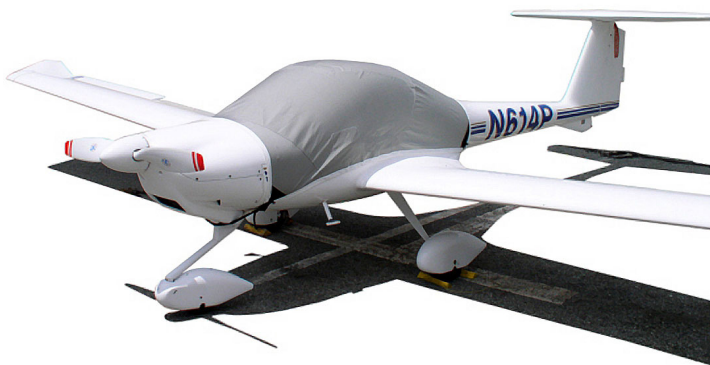
Diamond DA-20 Canopy Cover

This cover type is made from Silver Acrylic Sunbrella canvas and is 100% lined with a soft and smooth microfiber. Bruce's Custom Covers developed this material combination especially for aircraft protection. The outer material is medium weight and treated for water resistance, UV resistance and anti-static buildup. The inner lining is a very soft and smooth microfiber to prevent scratching. The material is very reflective, and tests show that the cabin interior temperature can be reduced to near-ambient temperature on the hottest of days. It is water, ice and snow repellent, yet breathable to allow moisture to escape from between the cover and the aircraft surface.