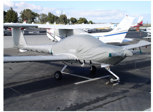
DA-20 Full Cover Set