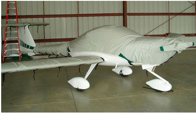
DA-20 Canopy/Engine, Prop/Spinner, Wing, Tailboom, Horiz. Stab. Covers