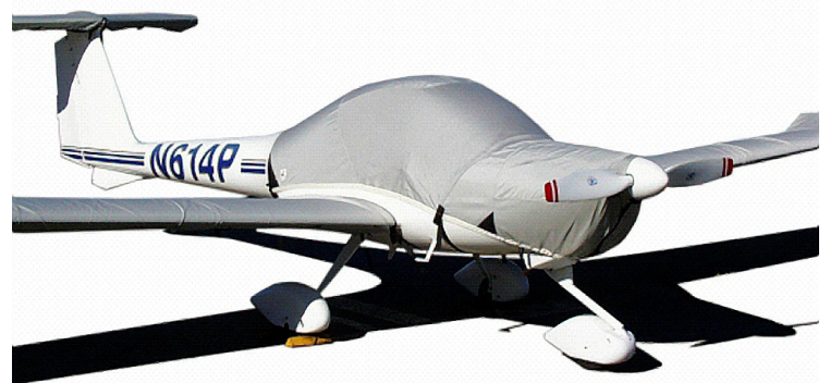
Diamond DA-20 Canopy/Engine, Wing & Horiz. Stab. Covers