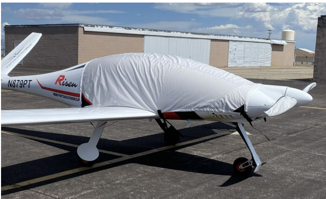
Swiss Excellence Risen 914 Canopy Cover

This cover type is made from Silver Acrylic Sunbrella canvas and is 100% lined with a soft and smooth microfiber. Bruce's Custom Covers developed this material combination especially for aircraft protection. The outer material is medium weight and treated for water resistance, UV resistance and anti-static buildup. The inner lining is a very soft and smooth microfiber to prevent scratching. The material is very reflective, and tests show that the cabin interior temperature can be reduced to near-ambient temperature on the hottest of days. It is water, ice and snow repellent, yet breathable to allow moisture to escape from between the cover and the aircraft surface.