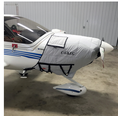
Diamond DA-20-C1 Insulated Engine Cover