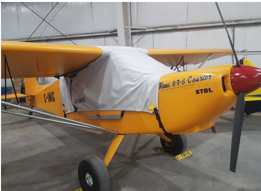
Rans S7 Courier Canopy Cover