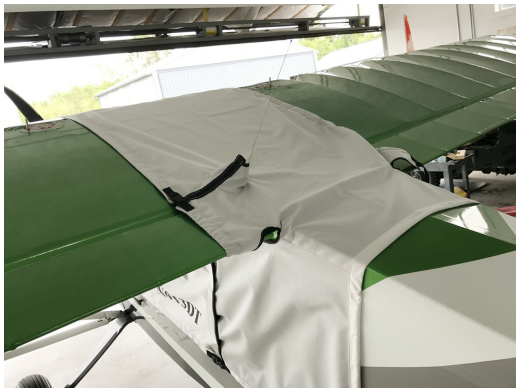
Rans S-7 Courier Canopy Cover (Over-The-Top Style), Belly Strap Type, Lsa Model (S7-S)

This cover type is made from Silver Acrylic Sunbrella canvas and is 100% lined with a soft and smooth microfiber. Bruce's Custom Covers developed this material combination especially for aircraft protection. The outer material is medium weight and treated for water resistance, UV resistance and anti-static buildup. The inner lining is a very soft and smooth microfiber to prevent scratching. The material is very reflective, and tests show that the cabin interior temperature can be reduced to near-ambient temperature on the hottest of days. It is water, ice and snow repellent, yet breathable to allow moisture to escape from between the cover and the aircraft surface.