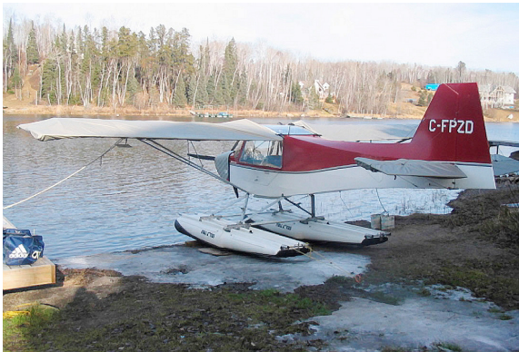
Rans S-7 Insulated Engine Cover, Wing Covers and Horizontal Stabilizer Covers

WINTER USE MATERIAL - Made with Solution-Dyed Polyester fabric, this option is intended for seasonal use to aid in deicing, rain mitigation, or for occasional travel. The material is lighter and more compact, but more susceptible to UV damage and may have a shorter useful life if used continuously outside than the all-year use material.