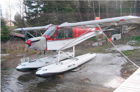
FOR INTERIOR USE. Cub Crafters CC-11 Insulated Hangar Blanket, Rans S-7 Insulated Engine, Wing and Horizontal Stabilizer Covers