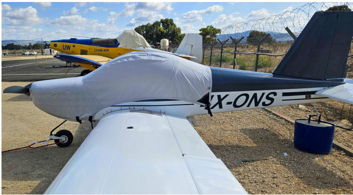
Rans S-19 Canopy/Engine Cover

This cover type is made from Silver Acrylic Sunbrella canvas and is 100% lined with a soft and smooth microfiber. Bruce's Custom Covers developed this material combination especially for aircraft protection. The outer material is medium weight and treated for water resistance, UV resistance and anti-static buildup. The inner lining is a very soft and smooth microfiber to prevent scratching. The material is very reflective, and tests show that the cabin interior temperature can be reduced to near-ambient temperature on the hottest of days. It is water, ice and snow repellent, yet breathable to allow moisture to escape from between the cover and the aircraft surface.