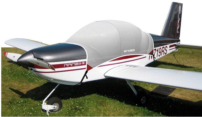
Rans S-19 Canopy Cover (illustration)