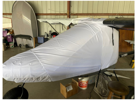
Rans S-12 Canopy/Nose Cover, test fit