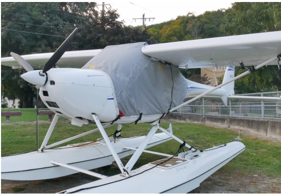
Remos G3 Extended Canopy Cover (Over-Top-Type Style)

This cover type is made from Silver Acrylic Sunbrella canvas and is 100% lined with a soft and smooth microfiber. Bruce's Custom Covers developed this material combination especially for aircraft protection. The outer material is medium weight and treated for water resistance, UV resistance and anti-static buildup. The inner lining is a very soft and smooth microfiber to prevent scratching. The material is very reflective, and tests show that the cabin interior temperature can be reduced to near-ambient temperature on the hottest of days. It is water, ice and snow repellent, yet breathable to allow moisture to escape from between the cover and the aircraft surface.