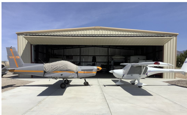
G-3/600 Travel Cover and Zlin 142 Canopy Cover

Travel Covers are made with Silver Solution-Dyed Polyester fabric and only lined over the windshield to save weight. The material is lightweight and more compact for easy stowage in the aircraft. The polyester material is water resistant, but only intended for occasional use outside. We also have an ultra lightweight material available for fitted hangar dust covers. For daily outdoor use, the non-travel Sunbrella Cover is the best choice.