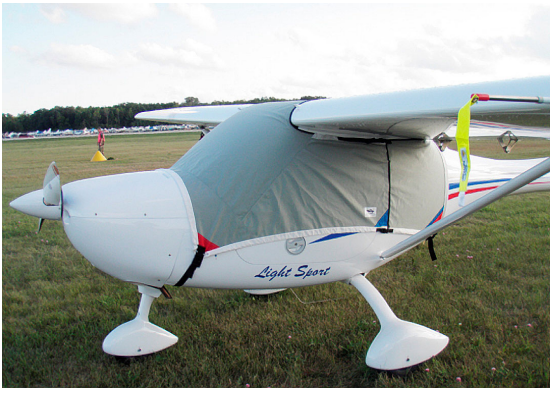
Remos G3 Travel Weight Canopy Cover