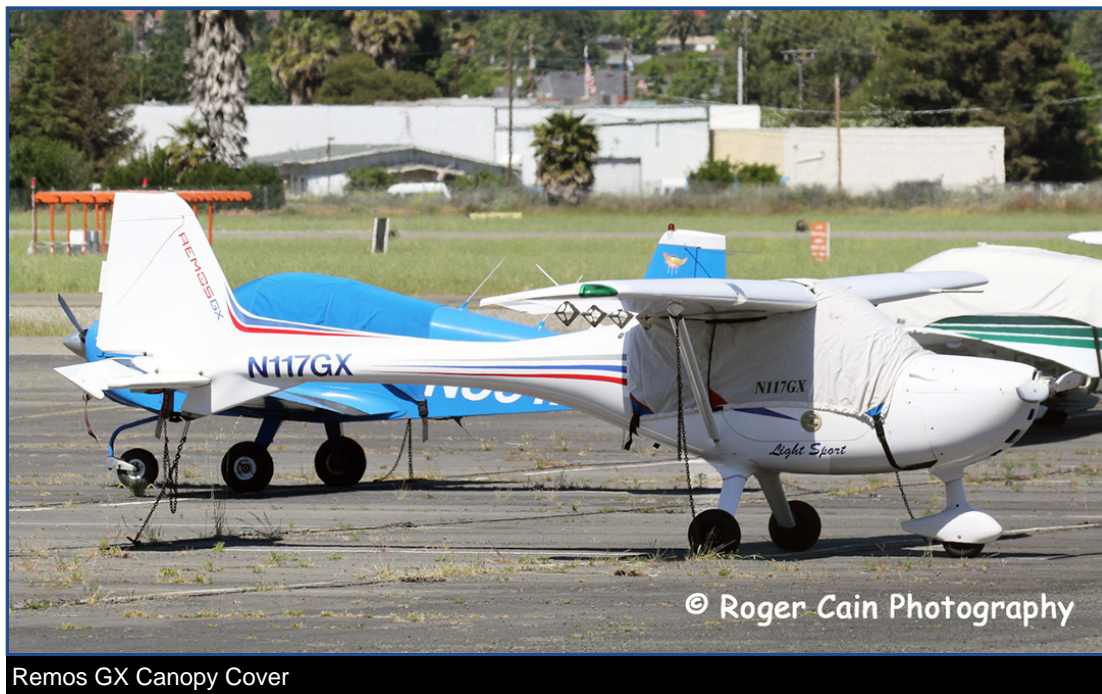
Remos GX Canopy Cover