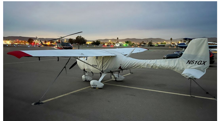
Remos RG-3 Complete Cover Set