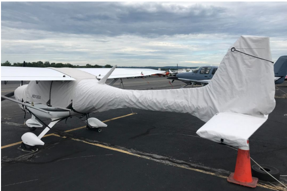
Remos G3 & GX MODELS Empennage Cover

WINTER USE MATERIAL - Made with Solution-Dyed Polyester fabric, this option is intended for seasonal use to aid in deicing, rain mitigation, or for occasional travel. The material is lighter and more compact, but more susceptible to UV damage and may have a shorter useful life if used continuously outside than the all-year use material.