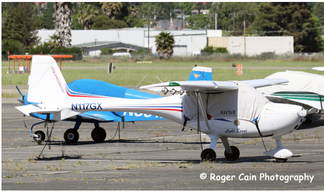
Remos GX Canopy Cover

This cover type is made from Silver Acrylic Sunbrella canvas and is 100% lined with a soft and smooth microfiber. Bruce's Custom Covers developed this material combination especially for aircraft protection. The outer material is medium weight and treated for water resistance, UV resistance and anti-static buildup. The inner lining is a very soft and smooth microfiber to prevent scratching. The material is very reflective, and tests show that the cabin interior temperature can be reduced to near-ambient temperature on the hottest of days. It is water, ice and snow repellent, yet breathable to allow moisture to escape from between the cover and the aircraft surface.