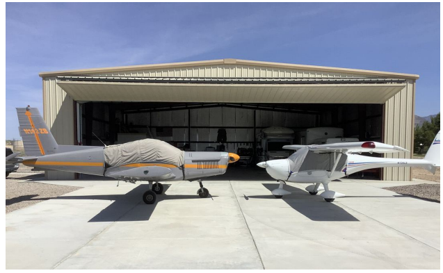
G-3/600 Travel Cover and Zlin 142 Canopy Cover