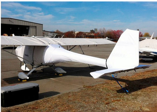
Remos Empennage Cover (test fit cover)

WINTER USE MATERIAL - Made with Solution-Dyed Polyester fabric, this option is intended for seasonal use to aid in deicing, rain mitigation, or for occasional travel. The material is lighter and more compact, but more susceptible to UV damage and may have a shorter useful life if used continuously outside than the all-year use material.