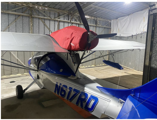
SeaRey LSA Insulated Engine Cover (LSA Model with engine nacelle)