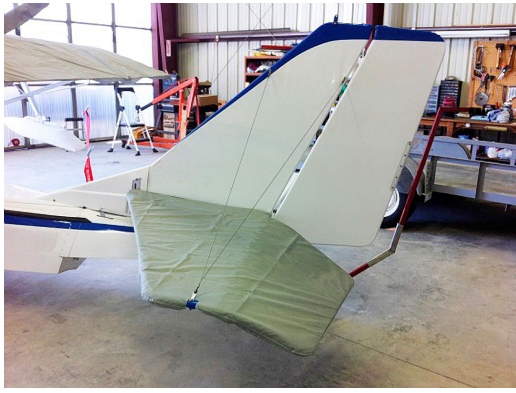
SeaRey Horizontal Stab. Cover (test fit cover)