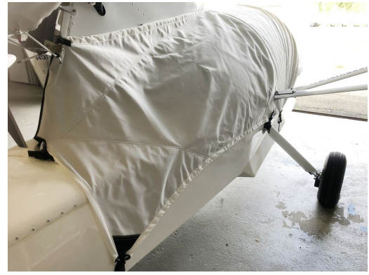
Searey Canopy/Nose Cover