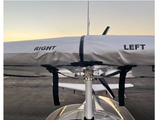
SeaRey Wing Covers