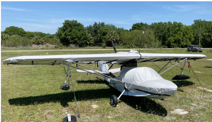
Searey Complete Cover Set