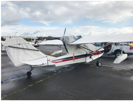
Searey Tail Covers, Engine Cover, Wing Covers