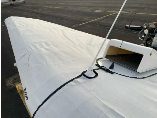
SeaRey Wing Covers

WINTER USE MATERIAL - Made with Solution-Dyed Polyester fabric, this option is intended for seasonal use to aid in deicing, rain mitigation, or for occasional travel. The material is lighter and more compact, but more susceptible to UV damage and may have a shorter useful life if used continuously outside than the all-year use material.