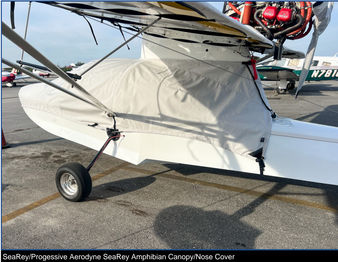
SeaRey/Progressive Aerodyne SeaRey Amphibian Canopy/Nose Cover