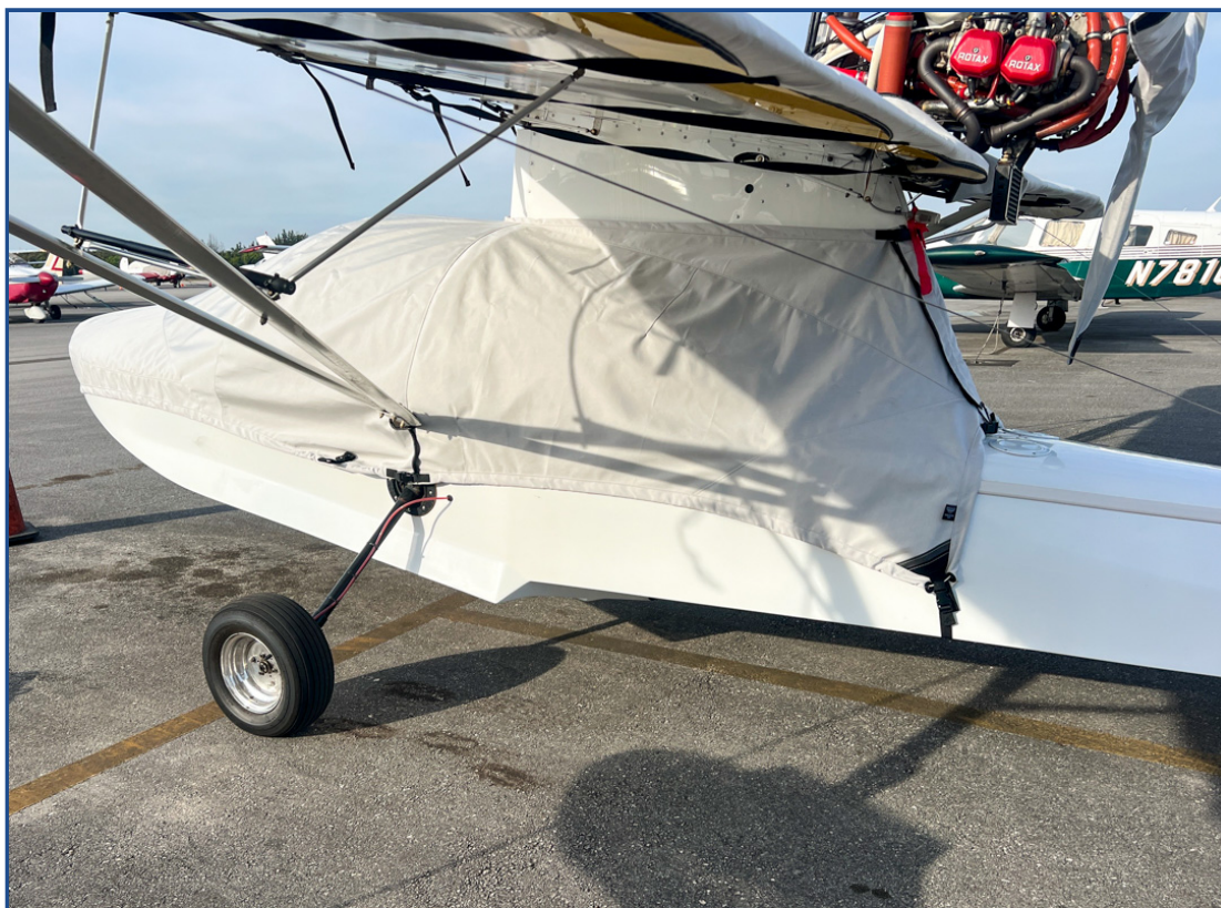
SeaRey/Progressive Aerodyne SeaRey Amphibian Canopy/Nose Cover