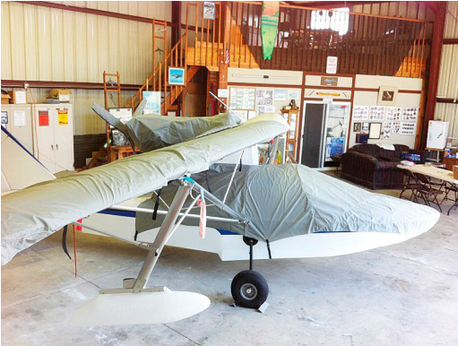
SeaRey Canopy, Engine & Wing (test fit covers)

WINTER USE MATERIAL - Made with Solution-Dyed Polyester fabric, this option is intended for seasonal use to aid in deicing, rain mitigation, or for occasional travel. The material is lighter and more compact, but more susceptible to UV damage and may have a shorter useful life if used continuously outside than the all-year use material.