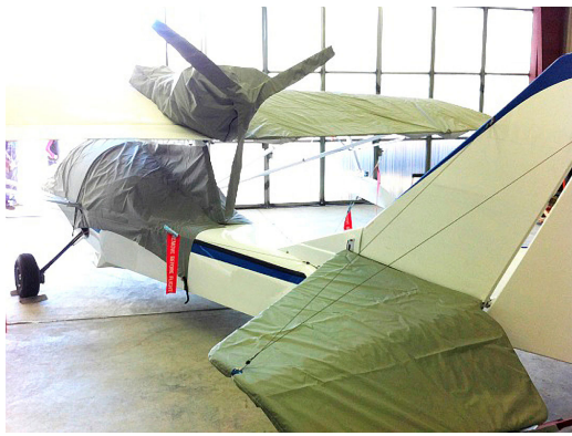
SeaRey Canopy, Engine, Wing & Horizontal Stab. (test fit covers)