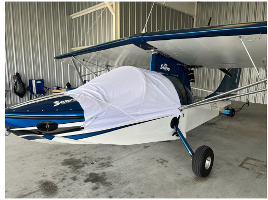
SeaRey Cockpit ONLY Cover, test fit cover