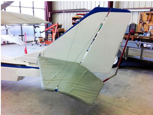
SeaRey Horizontal Stab. Cover (test fit cover)

WINTER USE MATERIAL - Made with Solution-Dyed Polyester fabric, this option is intended for seasonal use to aid in deicing, rain mitigation, or for occasional travel. The material is lighter and more compact, but more susceptible to UV damage and may have a shorter useful life if used continuously outside than the all-year use material.