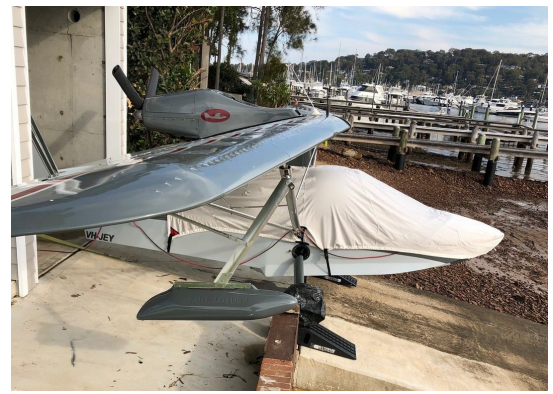
Searey Canopy/Nose Cover