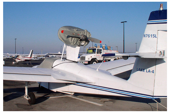
Lake Canopy & Engine Covers