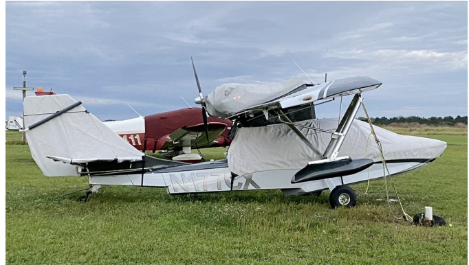
Searey Canopy/Nose, Engine & Empennage Cover