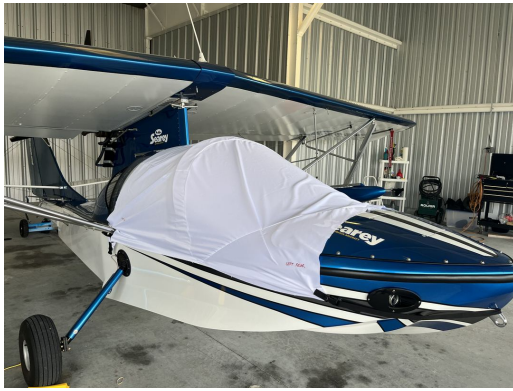
SeaRey Cockpit ONLY Cover, test fit cover