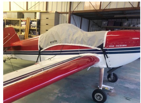
IAC One Design Travel Weight Canopy Cover