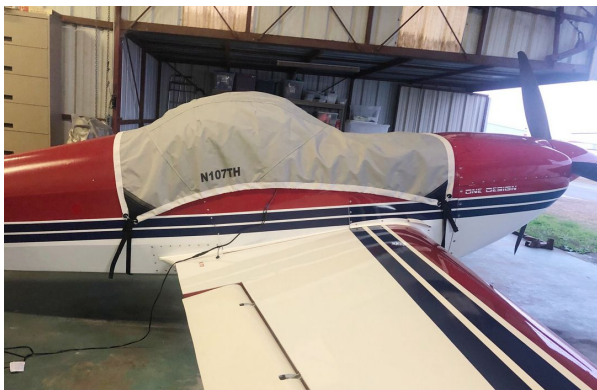
IAC One Design Travel Weight Canopy Cover

Travel Covers are made with Silver Solution-Dyed Polyester fabric and only lined over the windshield to save weight. The material is lightweight and more compact for easy stowage in the aircraft. The polyester material is water resistant, but only intended for occasional use outside. We also have an ultra lightweight material available for fitted hangar dust covers. For daily outdoor use, the non-travel Sunbrella Cover is the best choice.