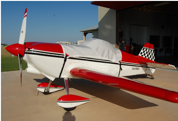
IAC One Design Canopy Cover

This cover type is made from Silver Acrylic Sunbrella canvas and is 100% lined with a soft and smooth microfiber. Bruce's Custom Covers developed this material combination especially for aircraft protection. The outer material is medium weight and treated for water resistance, UV resistance and anti-static buildup. The inner lining is a very soft and smooth microfiber to prevent scratching. The material is very reflective, and tests show that the cabin interior temperature can be reduced to near-ambient temperature on the hottest of days. It is water, ice and snow repellent, yet breathable to allow moisture to escape from between the cover and the aircraft surface.